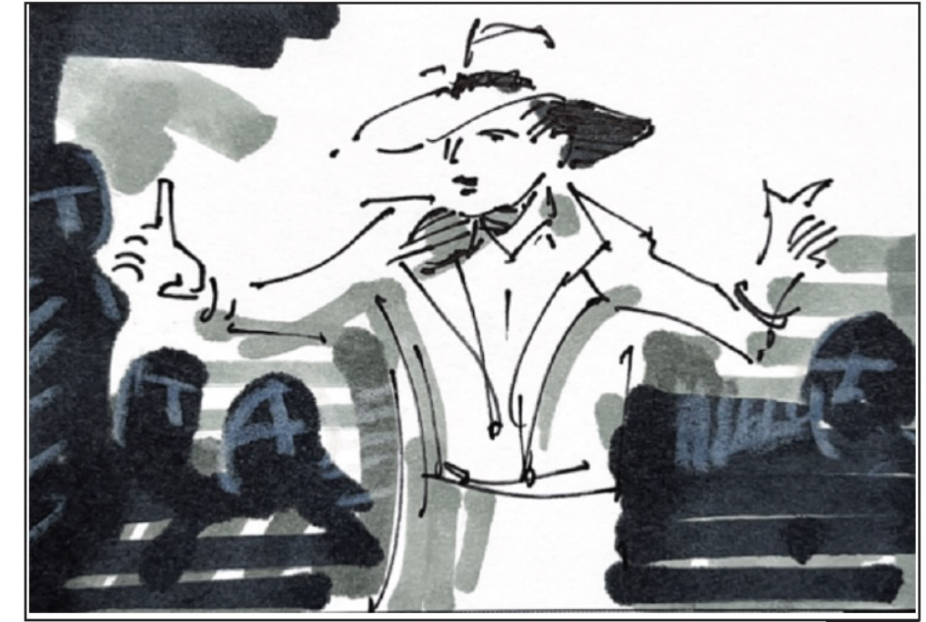
Scene 1 | Medium Wide Shot MUSEUM DIRECTOR motions left and right to direct the positioning.