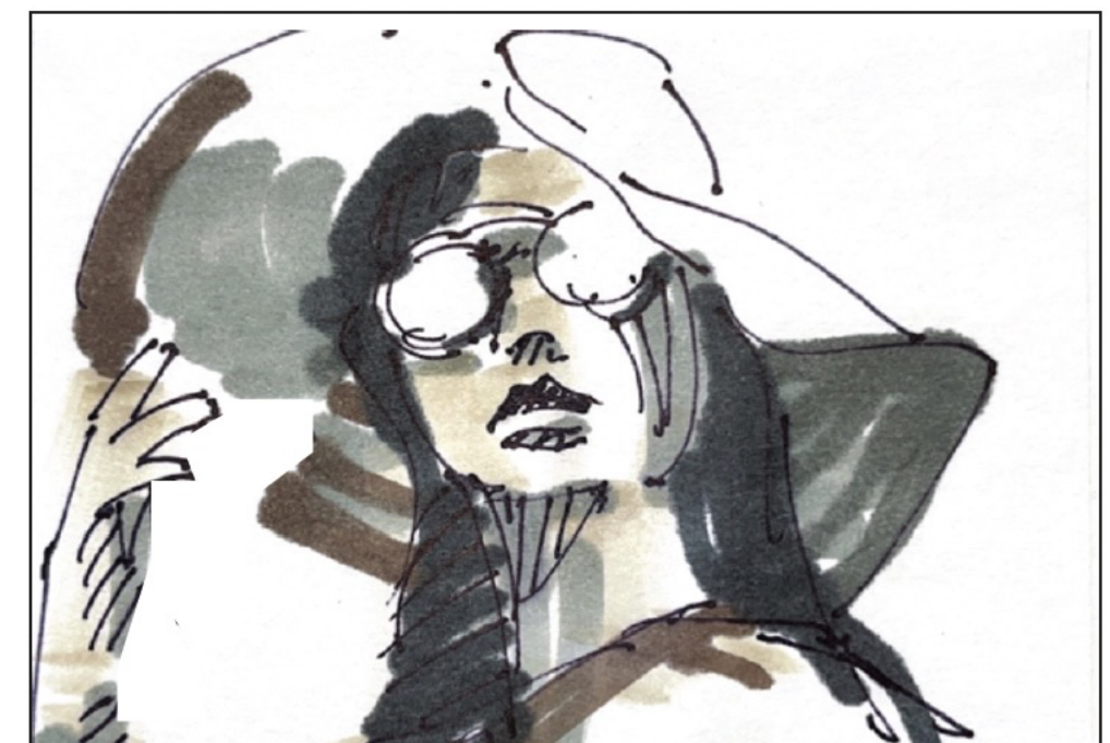
Scene 1 | Medium Close She turns to an ASSISTANT motions for the room to be cleared.