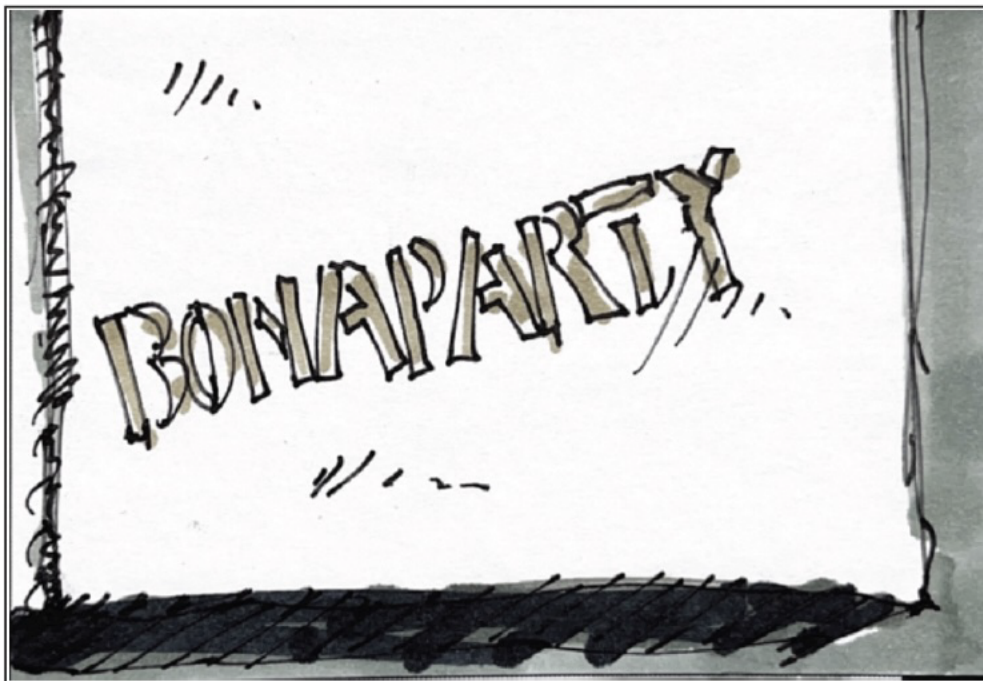
Scene 1 | Extreme Close Up (inset No.6) The Workers fold their ladders and leave. The bottom right corner stenciled name in block letters; "Bonaparty".