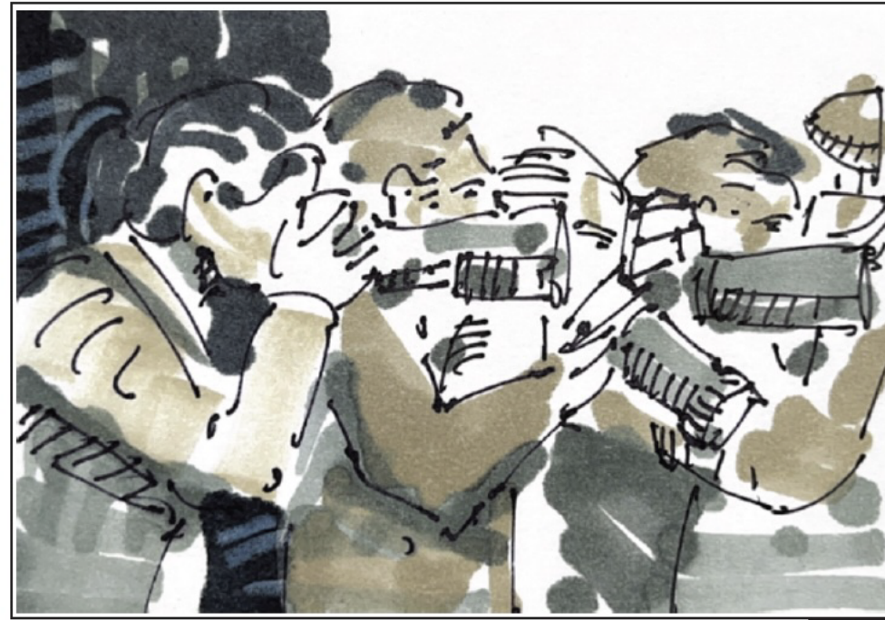
Scene 1 | Medium Wide Shot THE PRESS, in a group behind a velvet rope, take photos. Flash from cameras illuminate the men at work.