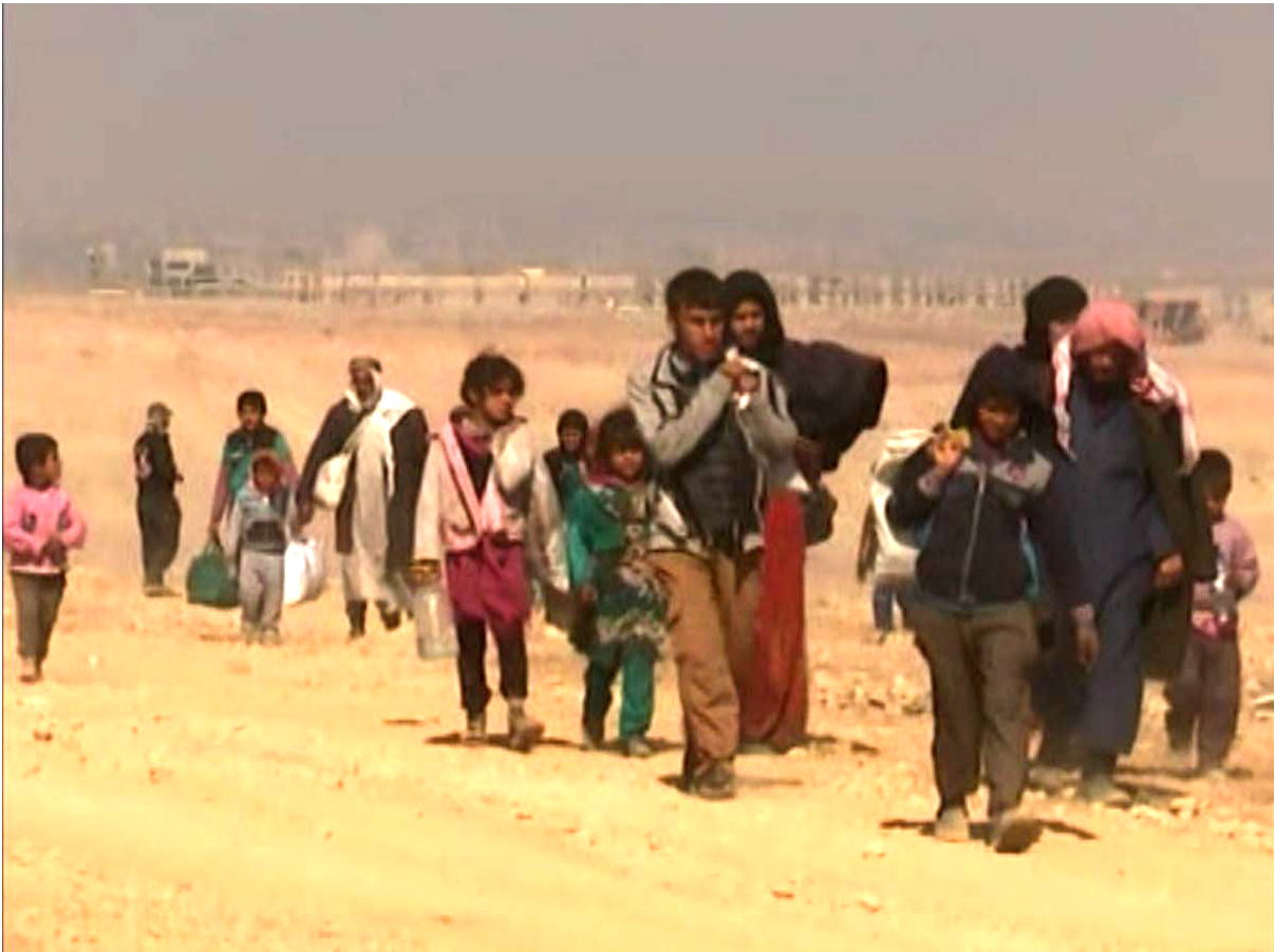
Die grossen Flüchtlingsströme von Mosul im Jahr 2014.

The story of a past massacre whose tragic legacy continues to this day.