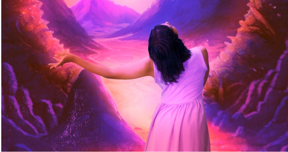
Sea of Fire – Cave