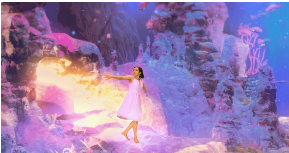
Sea of Fire – Undersea