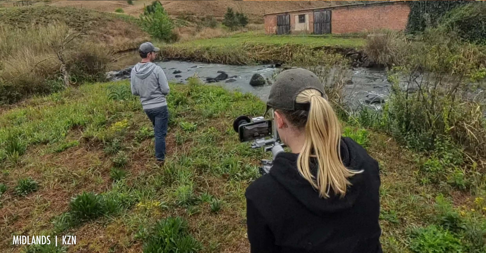
MIDLANDS | KZN