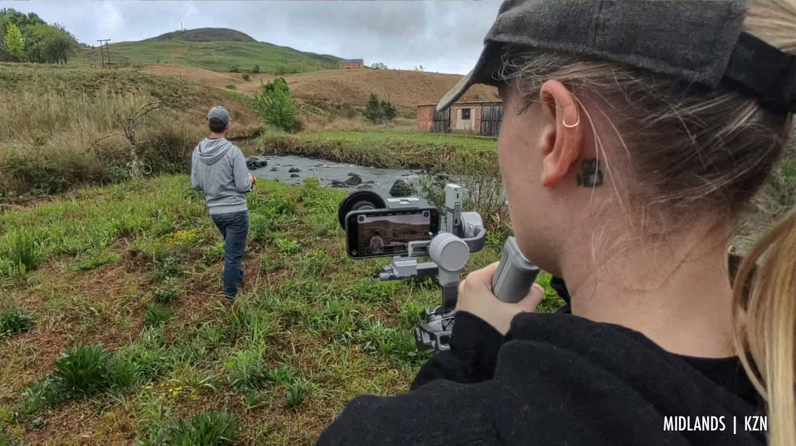
MIDLANDS | KZN