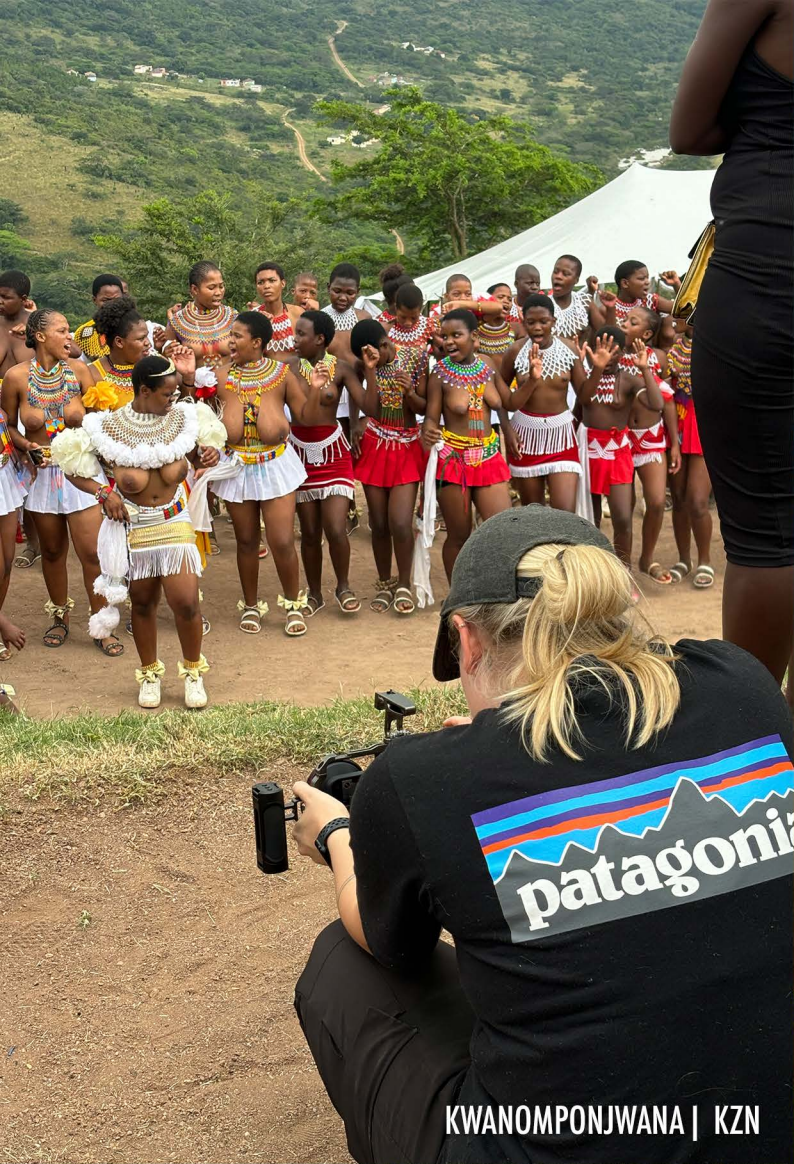
KWANOMPONJWANA | KZN