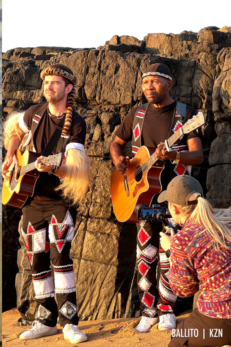
BALLITO | KZN