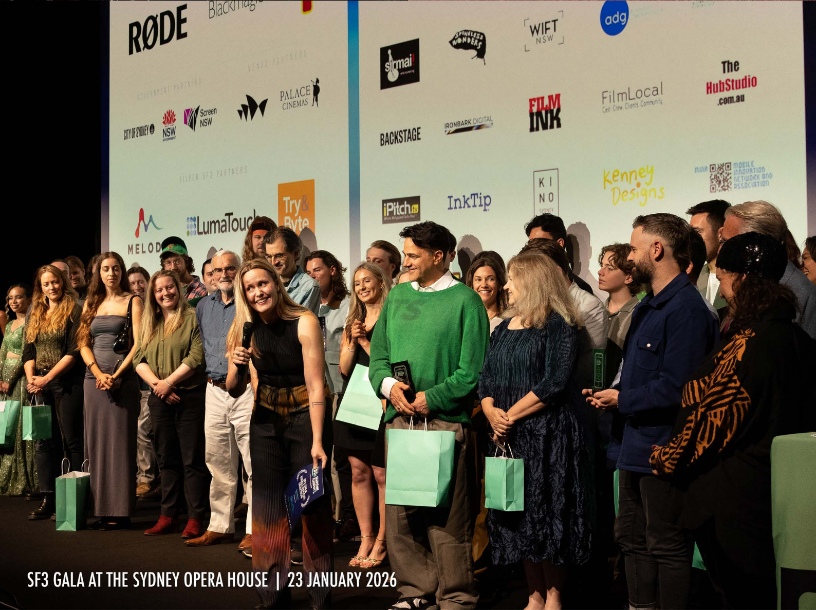
SF3 GALA AT THE SYDNEY OPERA HOUSE | 23 JANUARY 2026