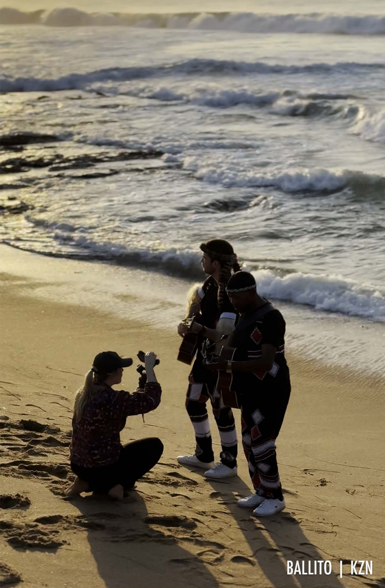
BALLITO | KZN