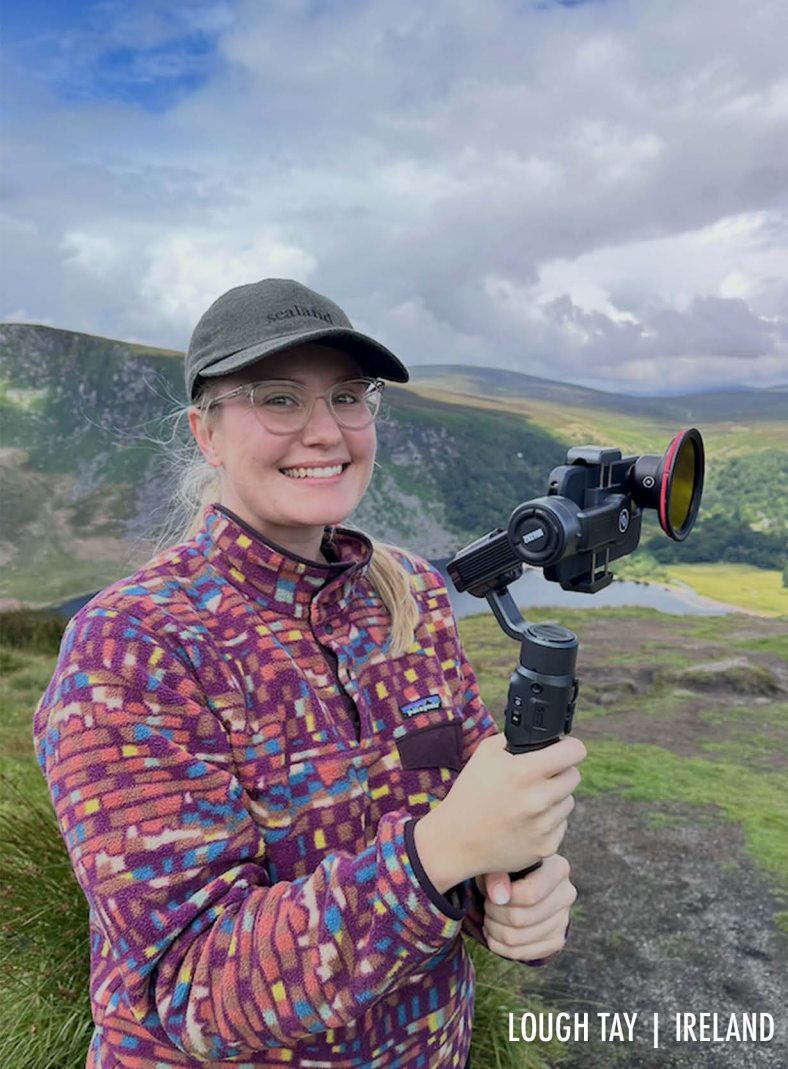
LOUGH TAY | IRELAND