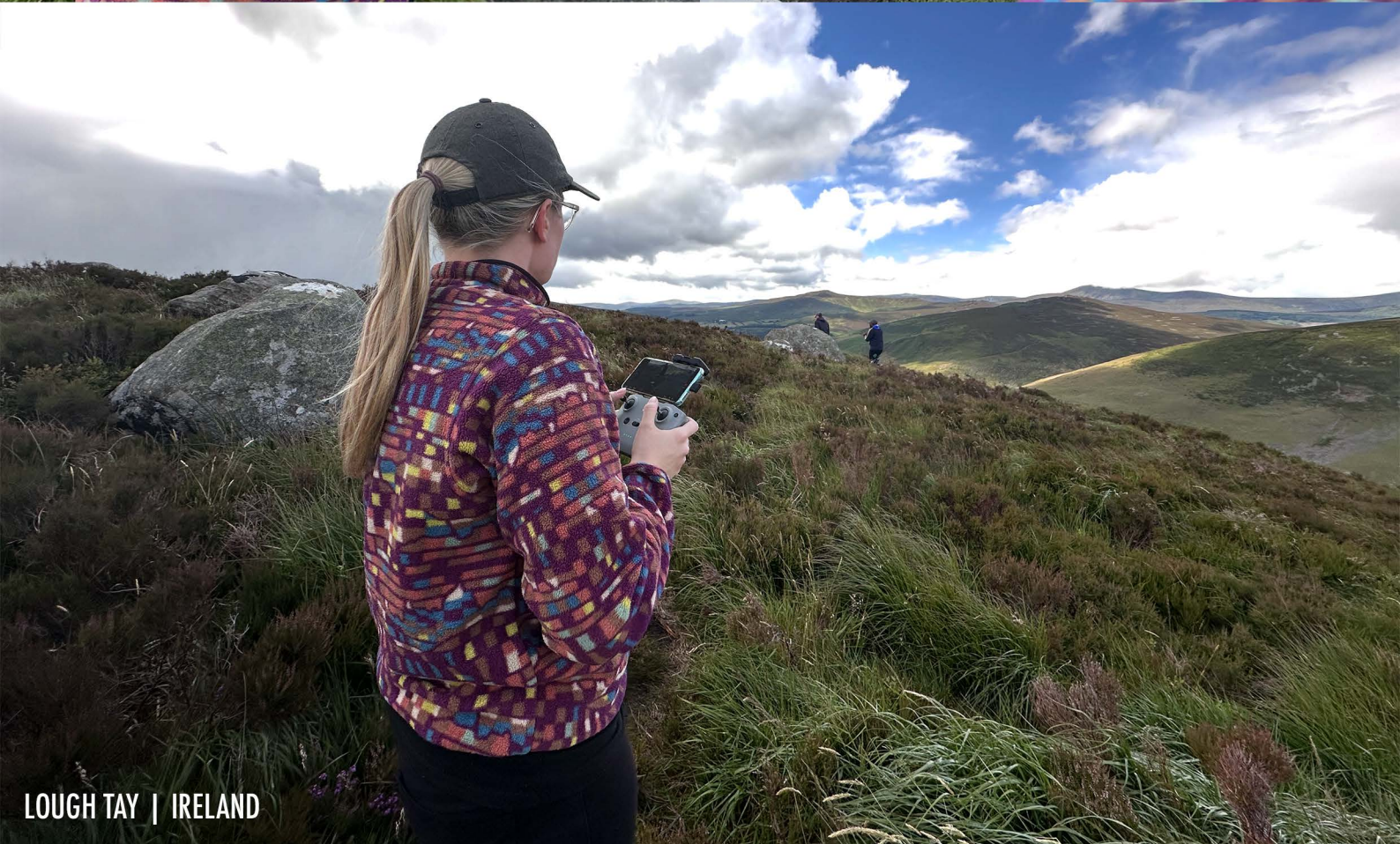
LOUGH TAY | IRELAND