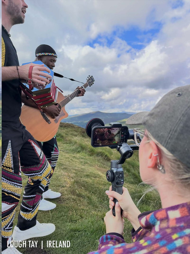
LOUGH TAY | IRELAND