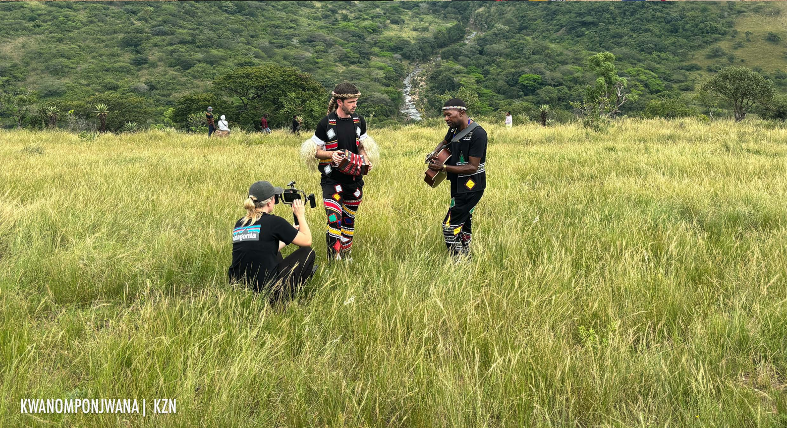
KWANOMPONJWANA | KZN