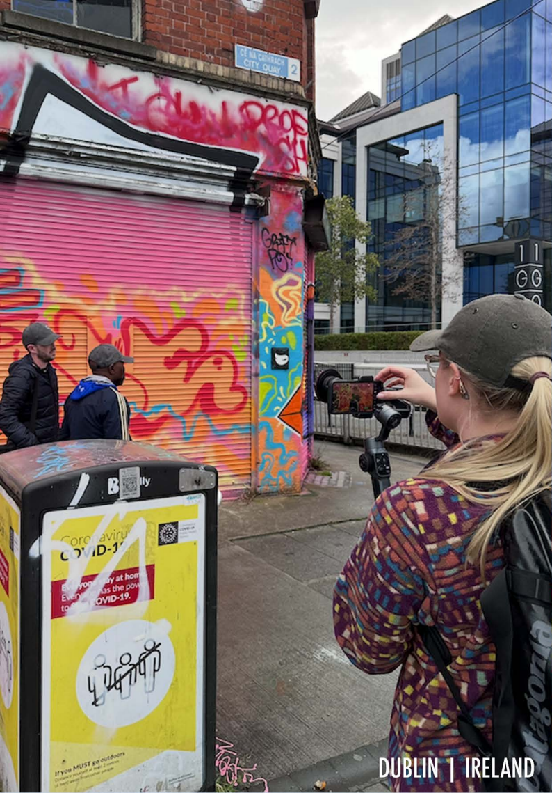
DUBLIN | IRELAND