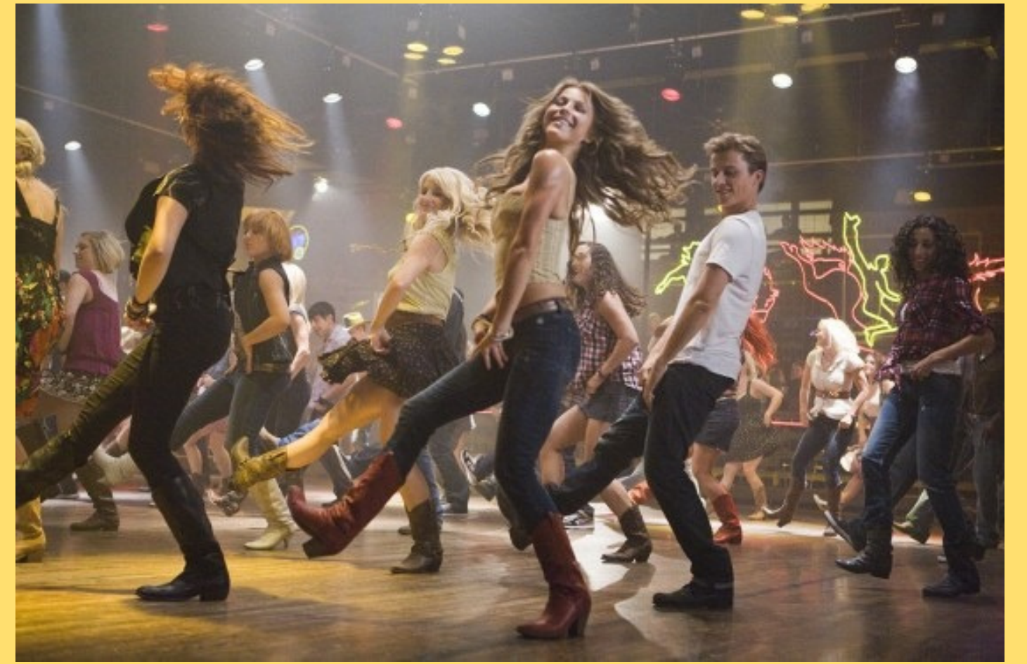
Footloose (Kenny Wormald)