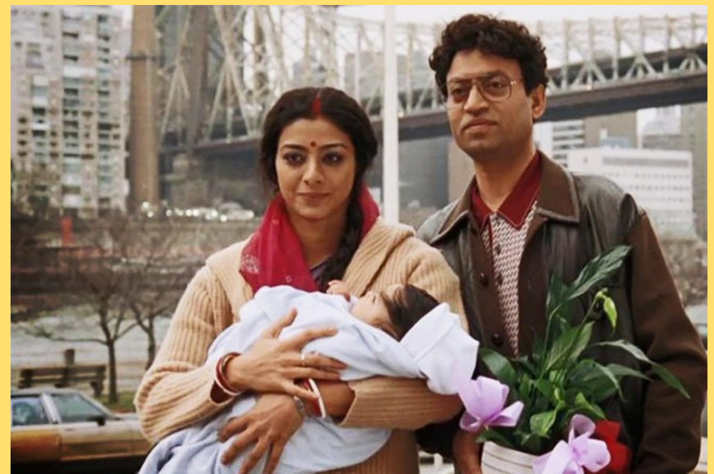
The Namesake (Tabu)