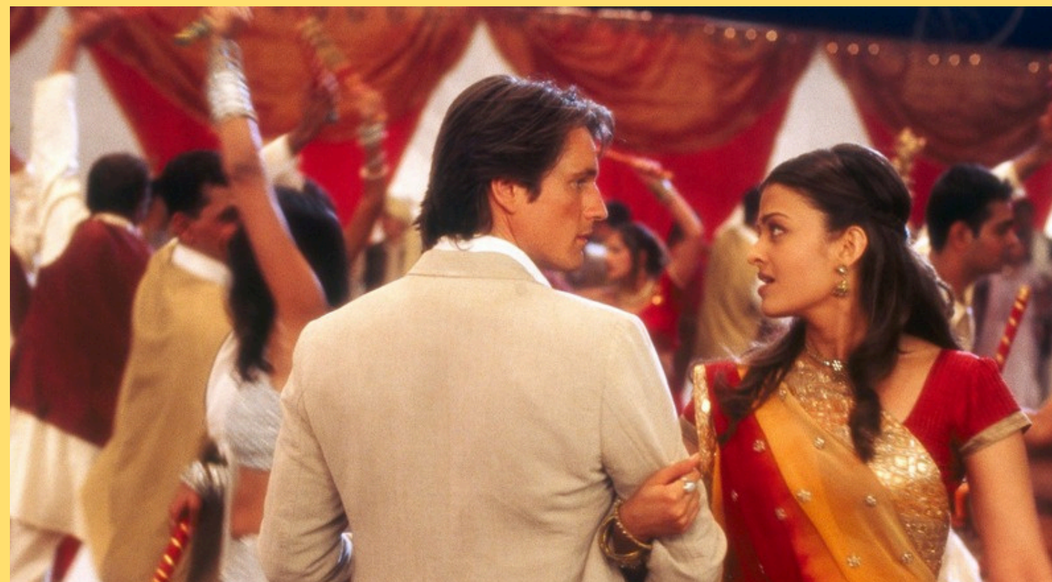
Bride & Prejudice (Aishwarya Rai))