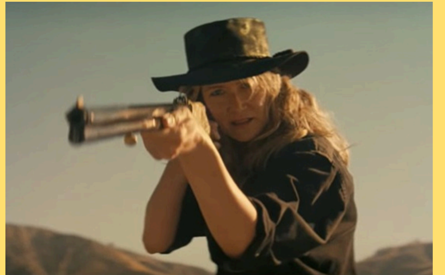
The Good Time Girls (Laura Dern)