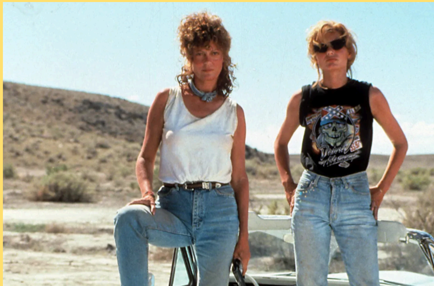
Thelma & Louise ( Susan Sarandon)