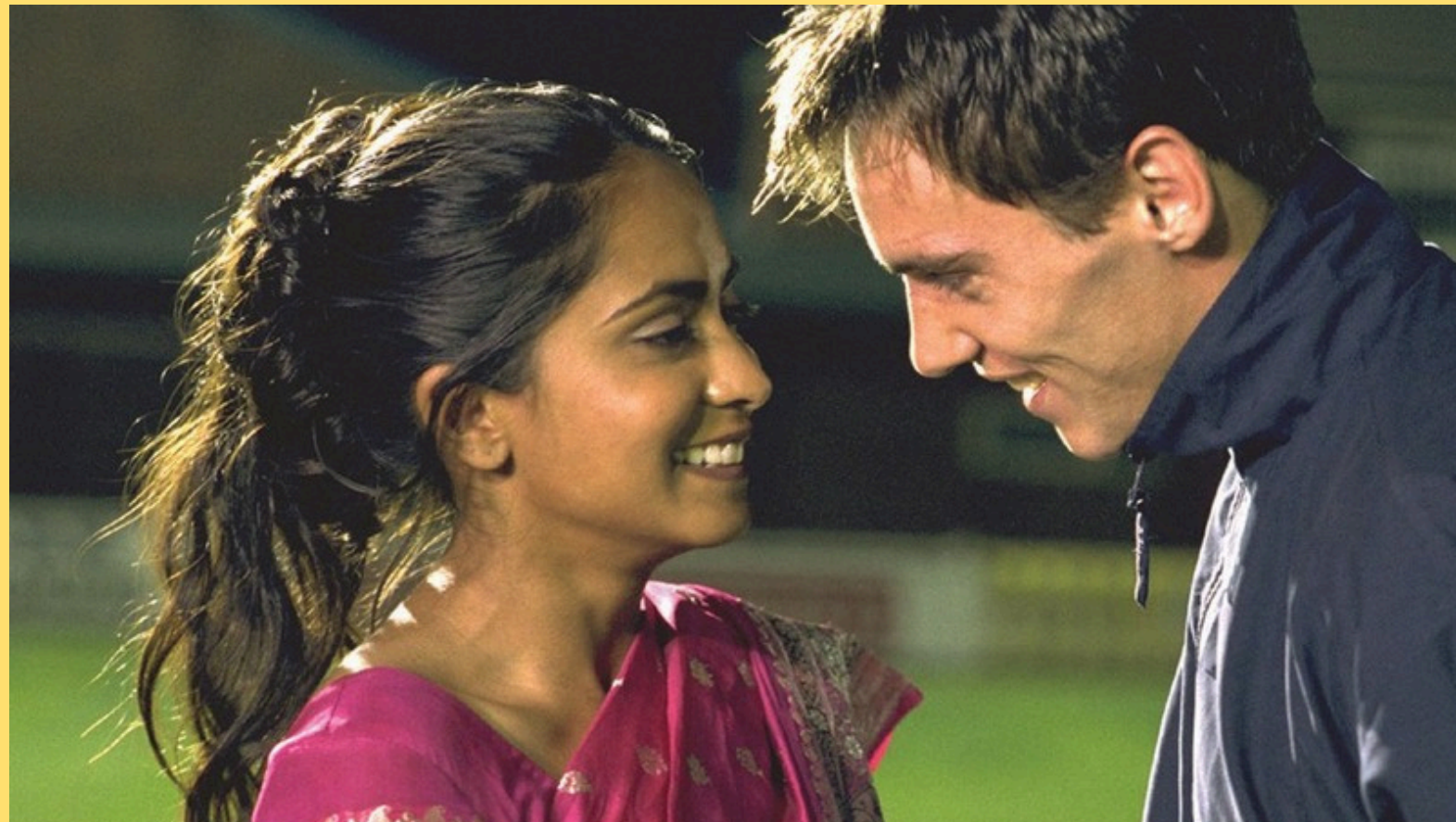
Bend it like Beckham (Parminder Nagra)