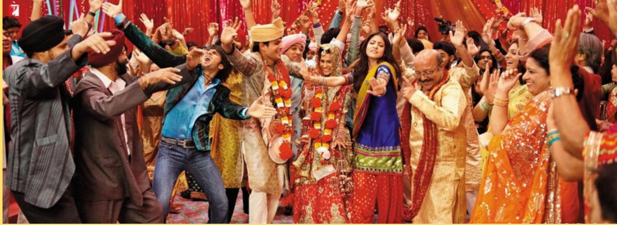
Band Bajaa Baraat (Anushka Sharma)