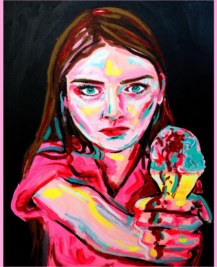
Painting by Becca Kozak

Sugar Rot is a film that challenges traditional gender roles and power dynamics, while also delivering on the exploitation genre's promise of blood, gore, and dark humor. It is a statement on how women's bodies are commodified and consumed by society. The image of a woman turning into ice cream is a powerful metaphor for how society views women as objects to be consumed and disposed of. By presenting this concept in an over-the-top exploitation film, we hope to draw attention to these issues and encourage discussions about gender, power, and objectification.