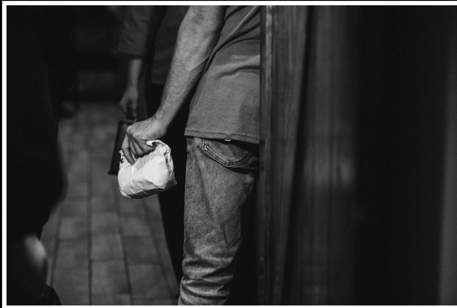
The famous White Ibis sandwich