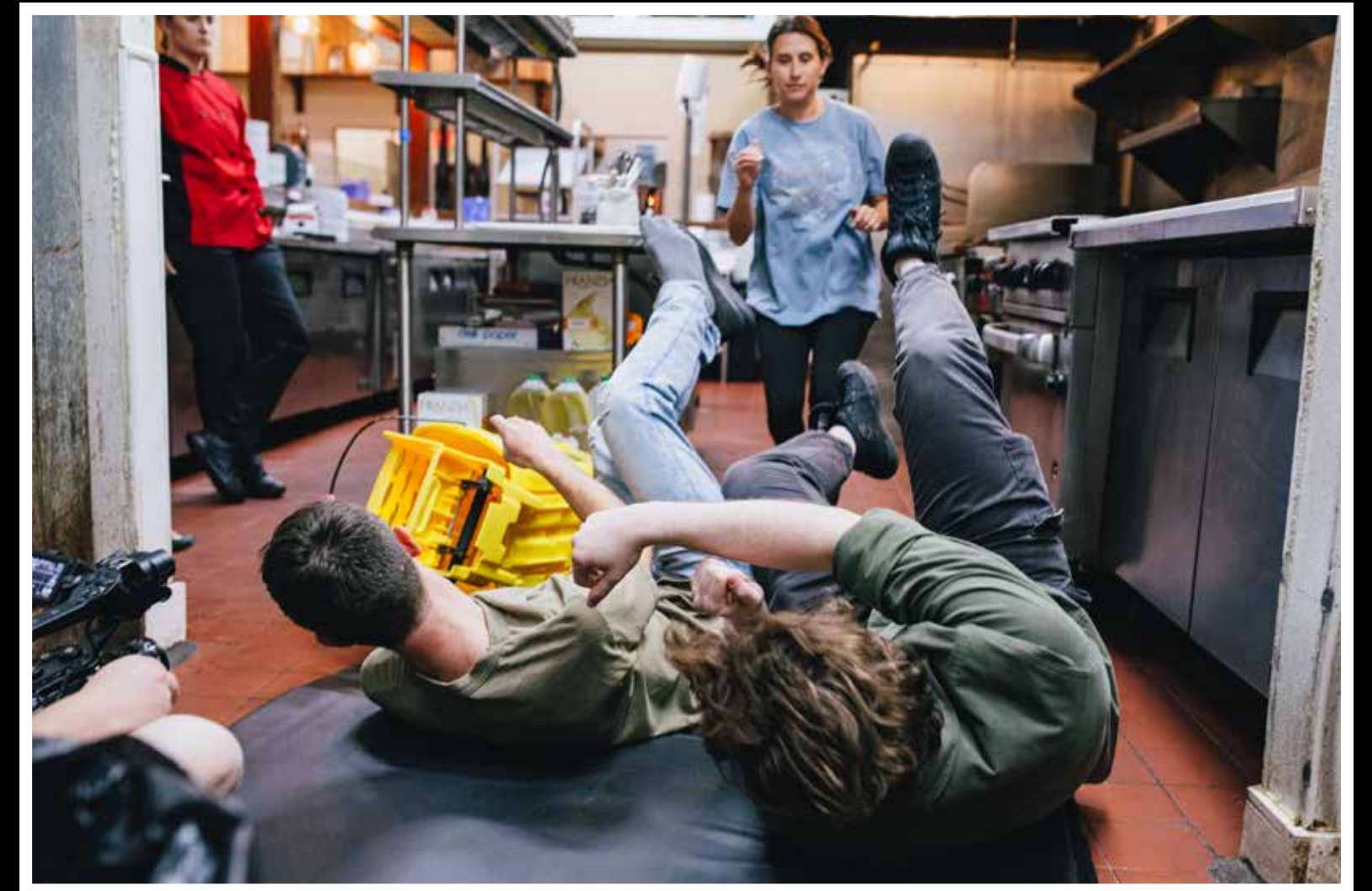
The cast and crew rehearsing a stunt