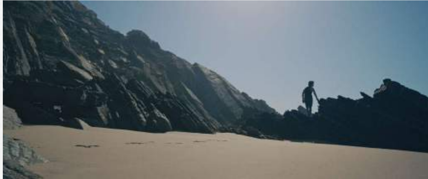
MONTE CLÉRIGO (2023) - 27' https://vimeo.com/739012055 (password: mc_23)