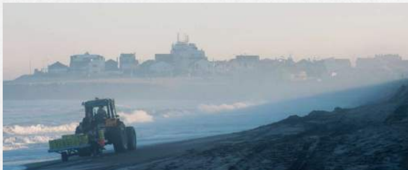
CARGA (2017) - 14' https://vimeo.com/201687230