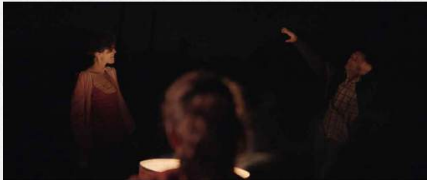
BOCA CAVA TERRA (2022) - 17' https://vimeo.com/716142429 (password: bct2022)