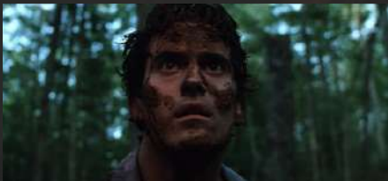
THE EVIL DEAD (1981)