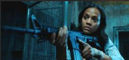
LA COLOMBIANA (2011)