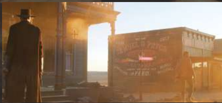
THE HARDER THEY FALL (2021)