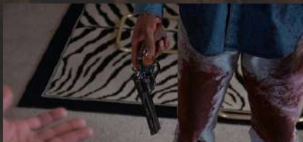
BOYZ N THE HOOD (1991)