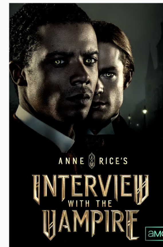
Interview with the Vampire 2022 -

Social commentary meets horror through magic, monsters, and systemic power plays.