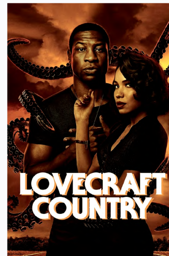
Lovecraft County 2020

Family, bloodlines, and ancient vampire politics collide in a tense supernatural hierarchy.