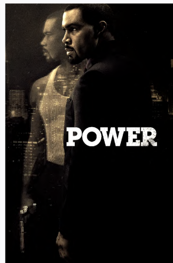
Power 2014 -20

A gritty, urban tale of loyalty, crime, and power struggles, set in a modern underworld.