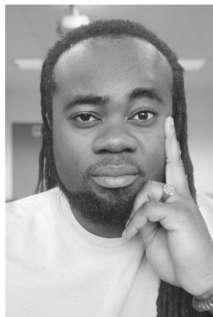
Rolaphton Mercure Zoe