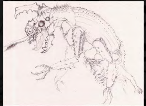
DESIGNED & DRAWN BY: Sanjay Unka