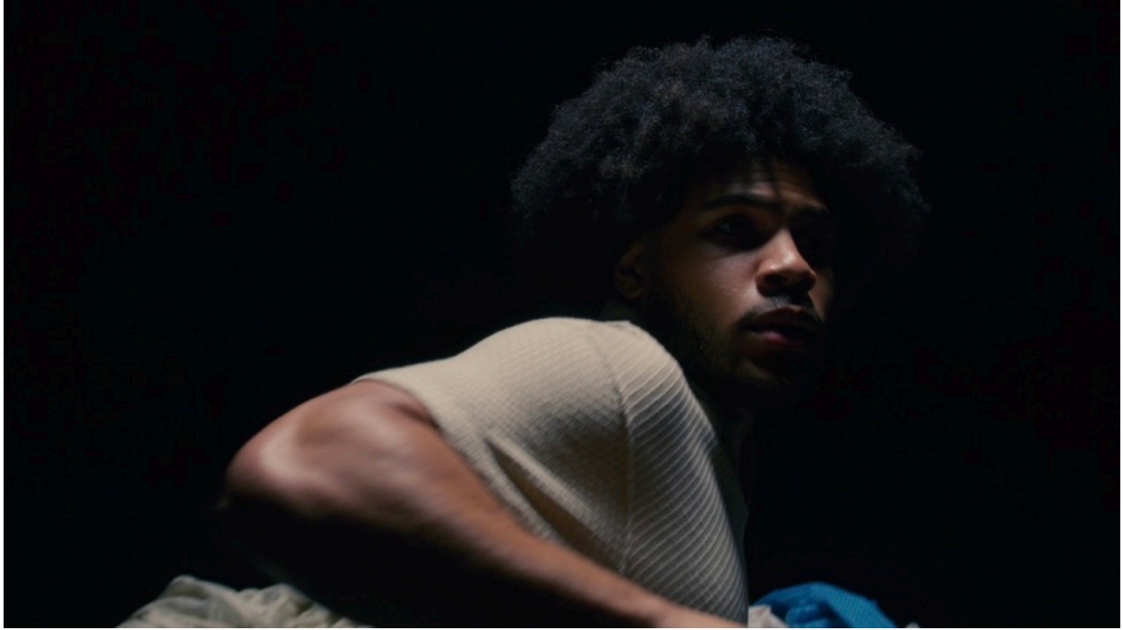
Still #2