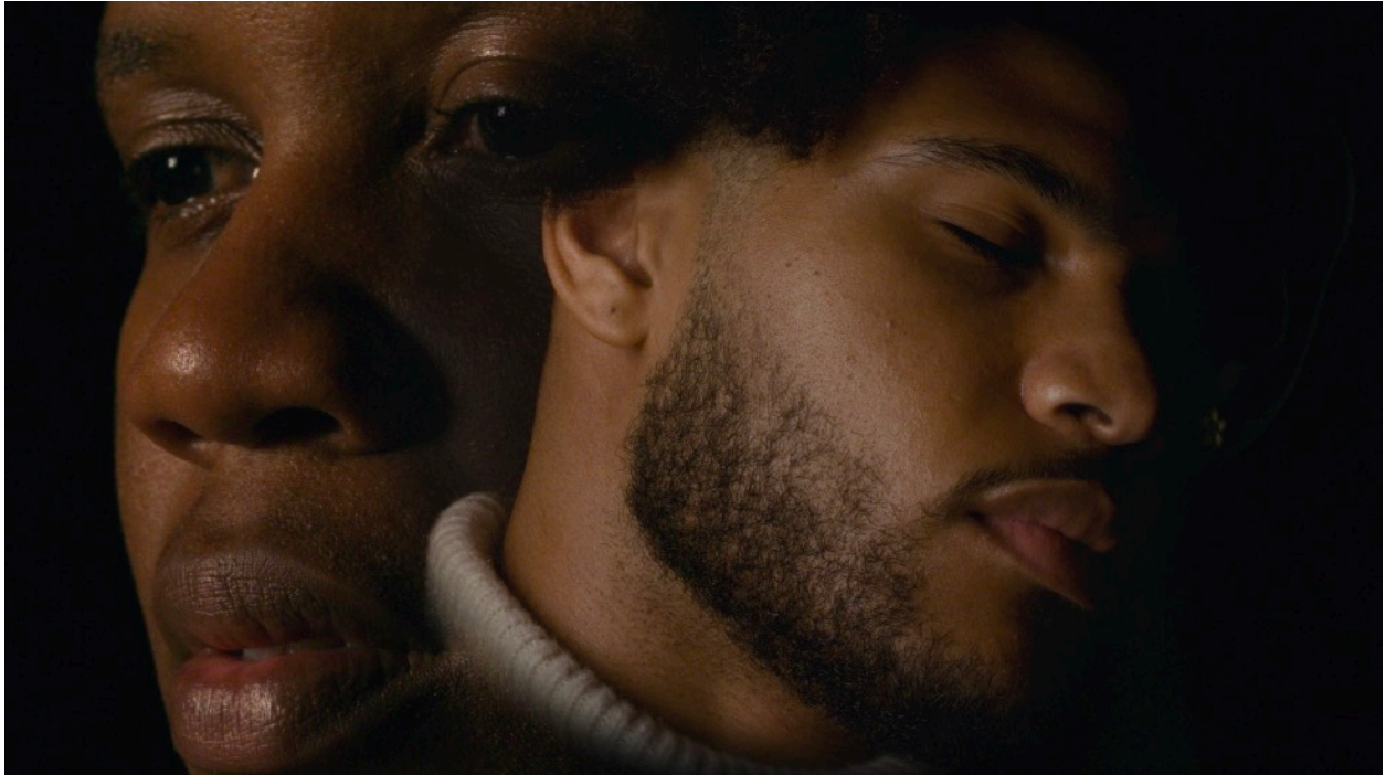
Still #1