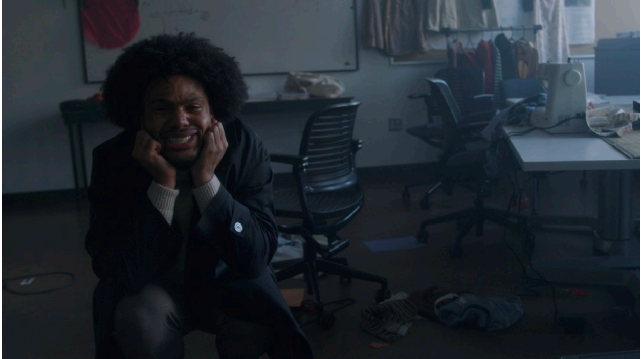
Still #4