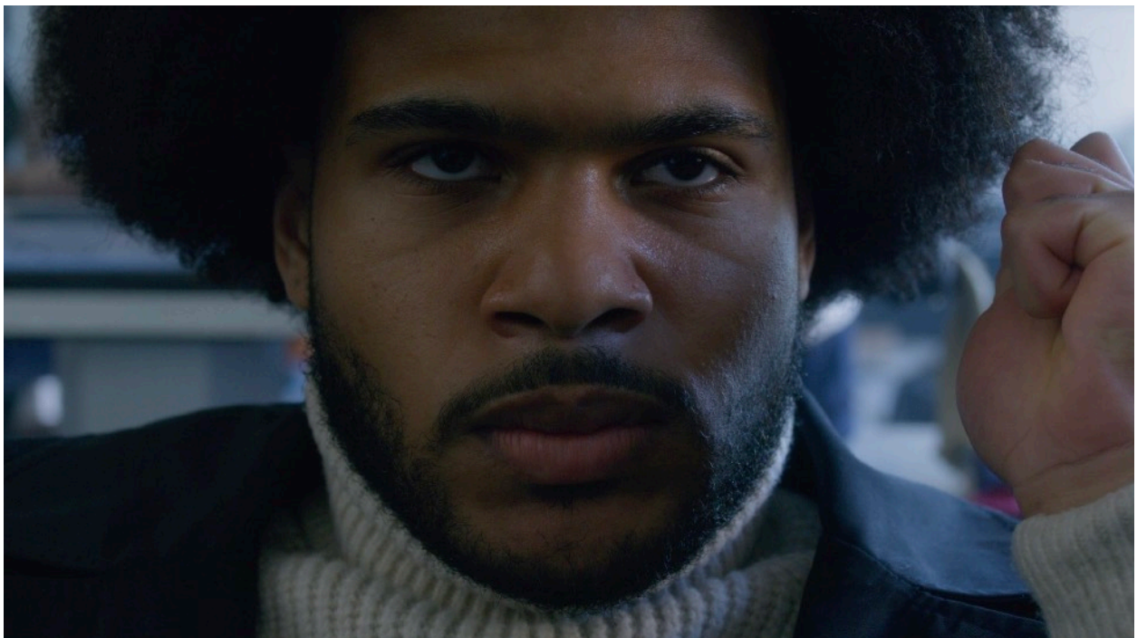
Still #3