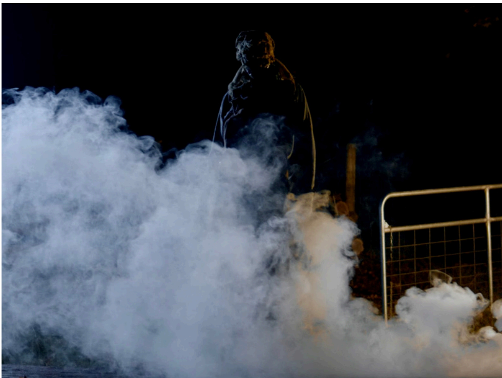
The Harvester (Sam Hall) stands tall on a dock, shrouded in fog.