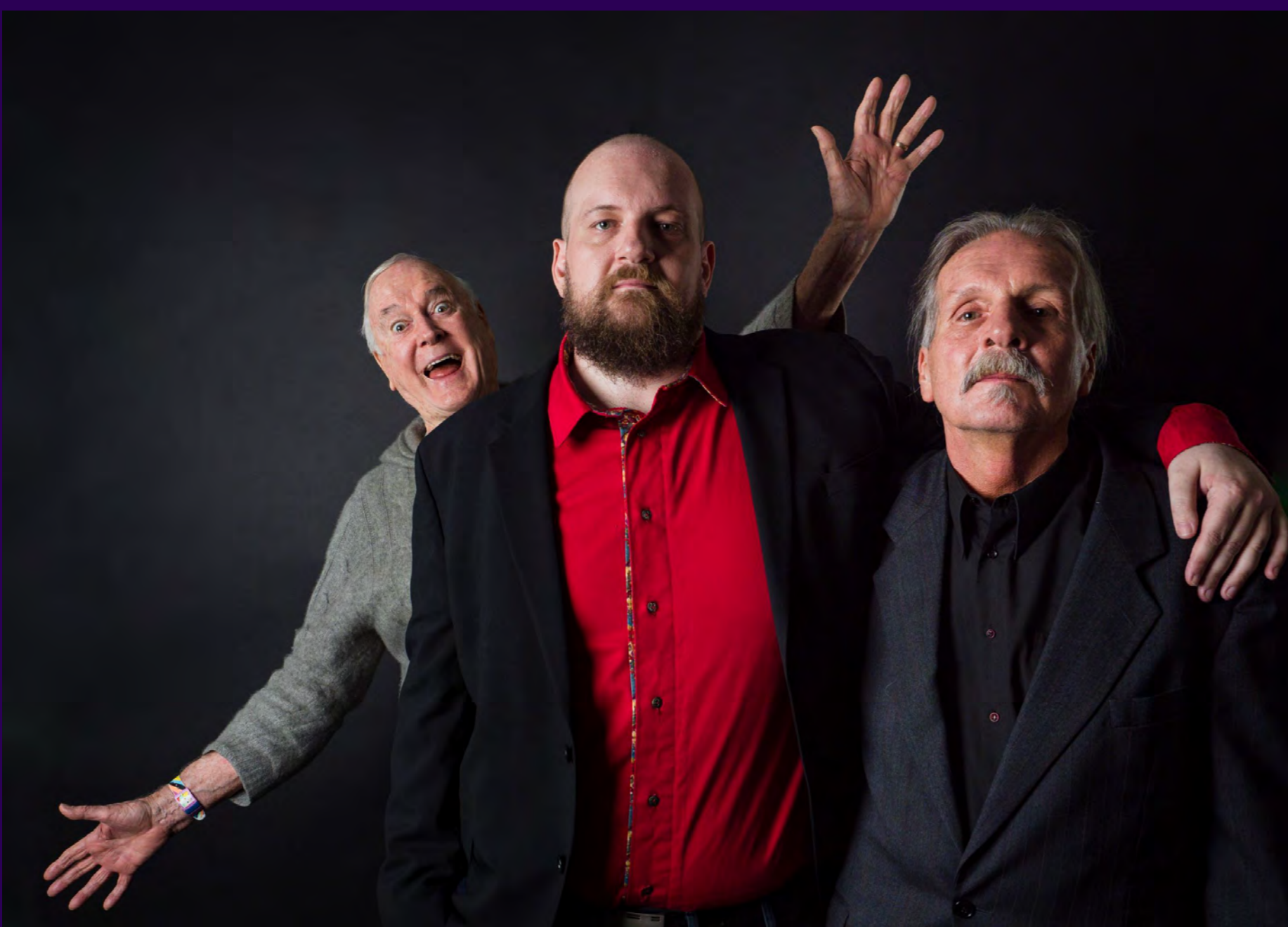
There's one in every crowd....