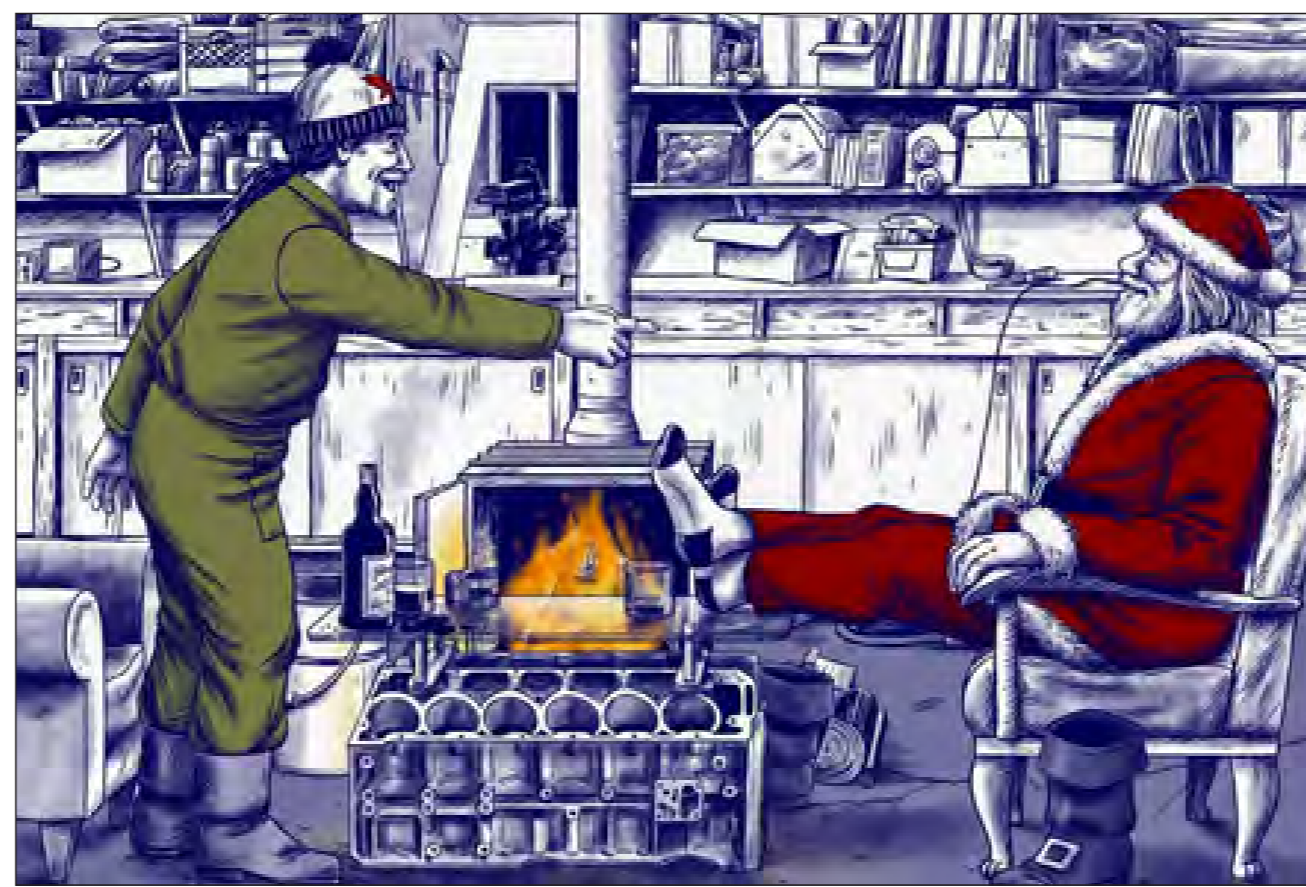
After crashing his sleigh into a Manitoulin home, Santa warms himself by the fire with a glass of Scotch and a chat with "Gramps."