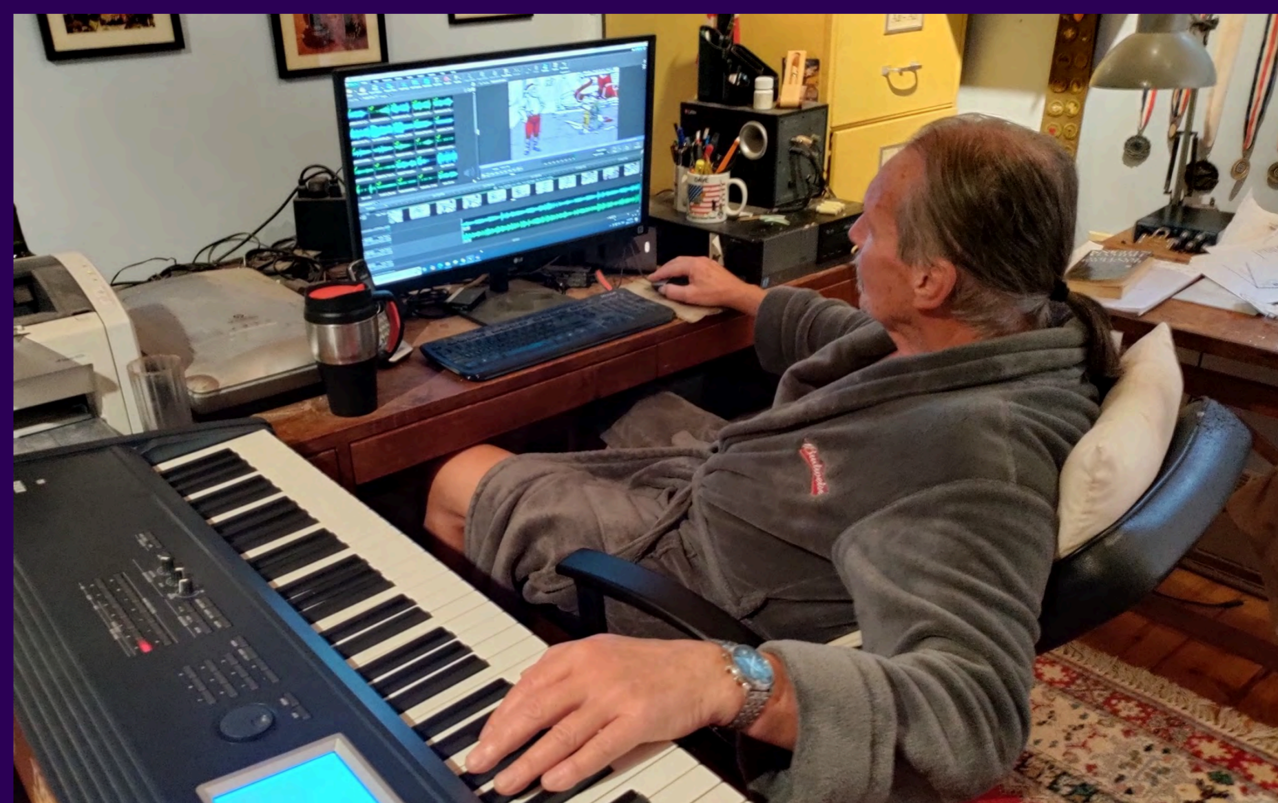
Ludwig van Bathrobe, composer, author, and coffee addict.