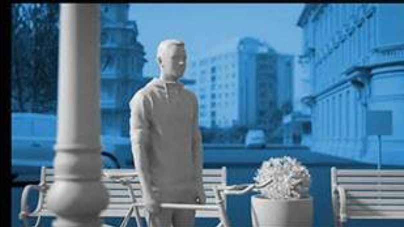
■ Practical set ■ LED wall