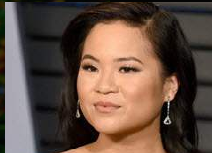
Kelly Marie Tran