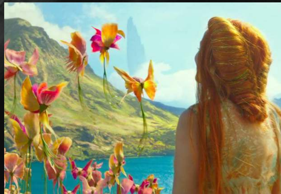
A Wrinkle in Time (2003)

A similarly bright, deceptively cheerful color palette and vibe.