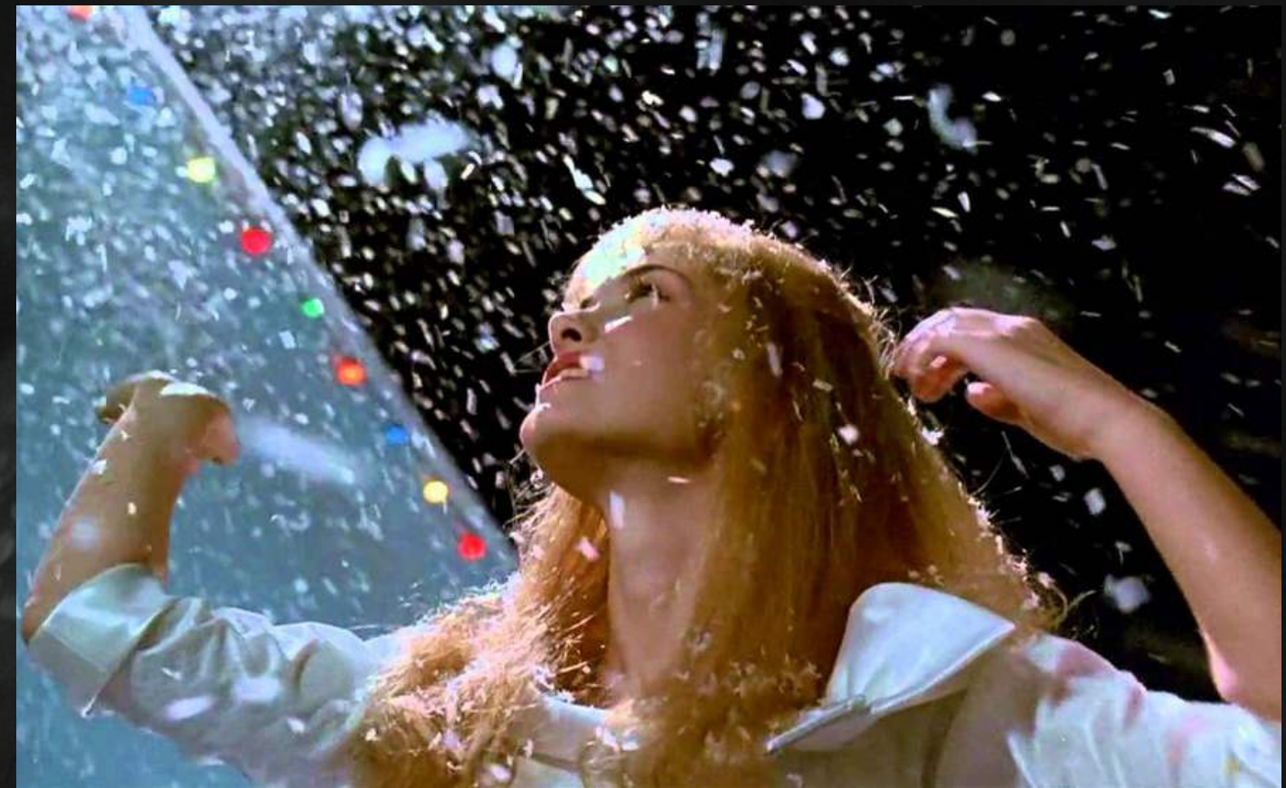
Edward Scissorhands (1990)

The otherworldly vibe and sense that anything could happen is reminiscent of A WRINKLE IN TIME. Thoughts become reality as in WHAT DREAMS MAY COME.