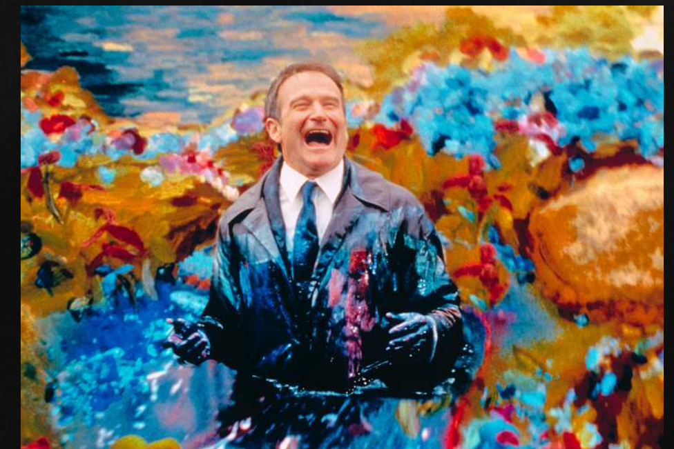
What Dreams May Come (1998)

Regular people brought to colorful, fantastical landscapes.