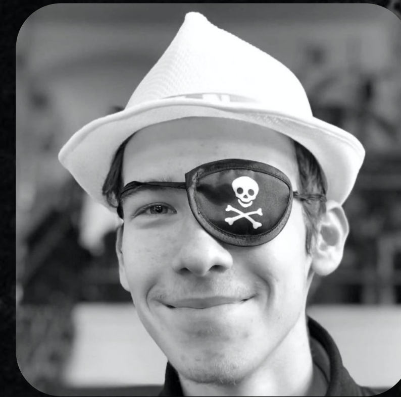
VENDEL FORT Boom operator