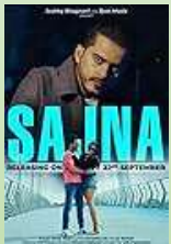
Sajna Music Video Director Producer 2023