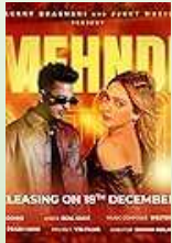
Mehndi Music Video Director Producer 2023