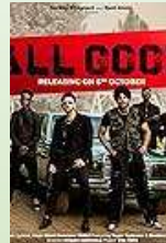
All Good Music Video Director Producer 2023