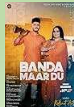
Banda Maar Du Music Video Director Producer 2021