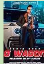
G-Wagon Music Video Director Producer 2023