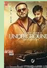
Underground Music Video Director Producer 2021