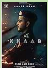
Ik Khaab Music Video Director Producer 2022