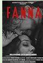
Fanna Music Video Director Producer 2023