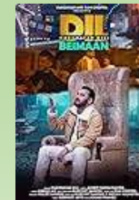
Dil Beimaan Music Video Director Producer 2021