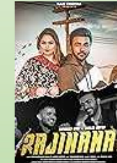
Rajinama Music Video Director Producer 2021