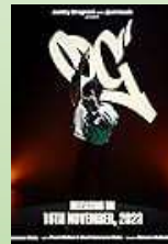
OG Music Video Director Producer 2023