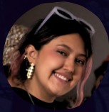
JERILEE A. MORALES PRODUCTION DESIGN