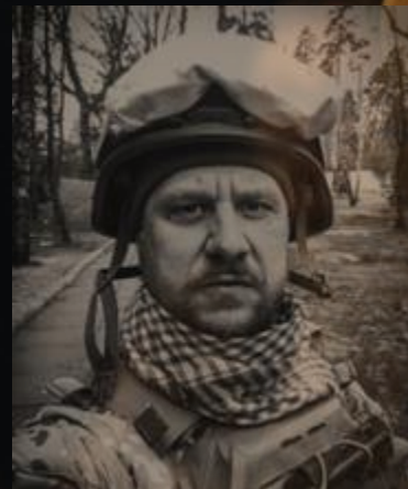
Screenplay by Pavlo Beliansky