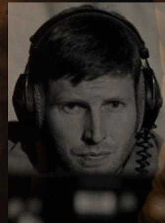
Sound design Serhii Stepanskyi