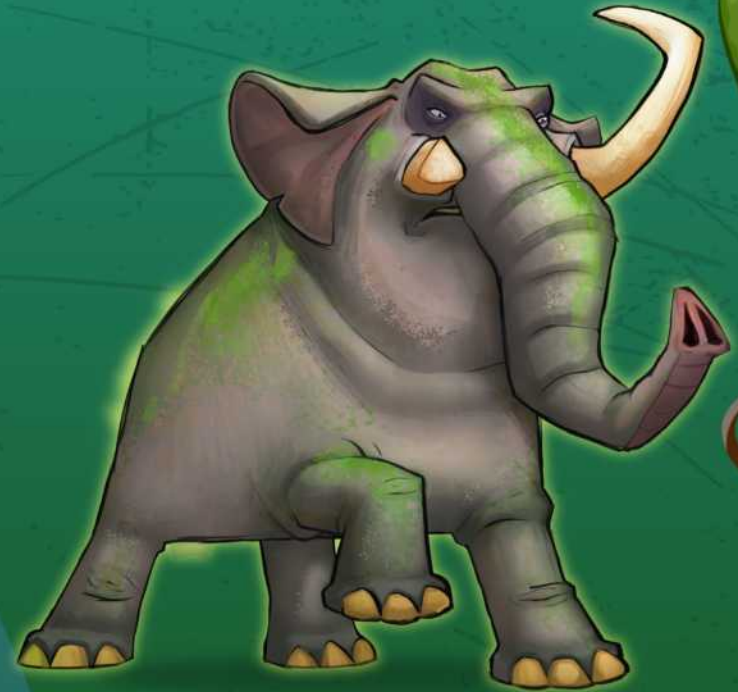
GAJAH BELUKAR (The Fierce Elephant)

A fierce predator who has a secret agenda. The Harimau Kumbang is cunning and constantly acting behind the scene. Though it is wary that Kancil can prevent its plans from becoming to fruition.