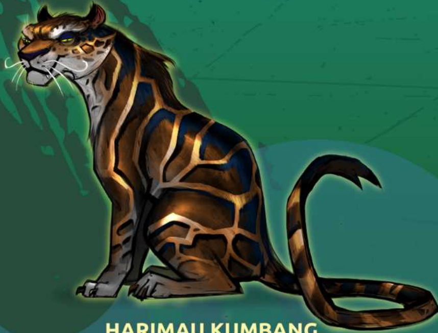
HARIMAU KUMBANG (The Black Panther)

A fierce predator who has a secret agenda. The Harimau Kumbang is cunning and constantly acting behind the scene. Though it is wary that Kancil can prevent its plans from becoming to fruition.