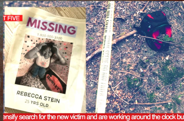
intensify search for the new victim and are working around the clock bu

Samantha Blake is the news anchor in "The Box." She serves as a key expositor, delivering the latest updates on the missing women case and setting the tone for the rising tension in the community. Through her broadcasts, Samantha connects the outside world to the intimate and dangerous dynamics unfolding within Emma's life, giving the audience critical context about the ongoing investigation and the broader implications of the crimes. Her role is essential in heightening the suspense and establishing the sense of urgency that surrounds the disappearances.