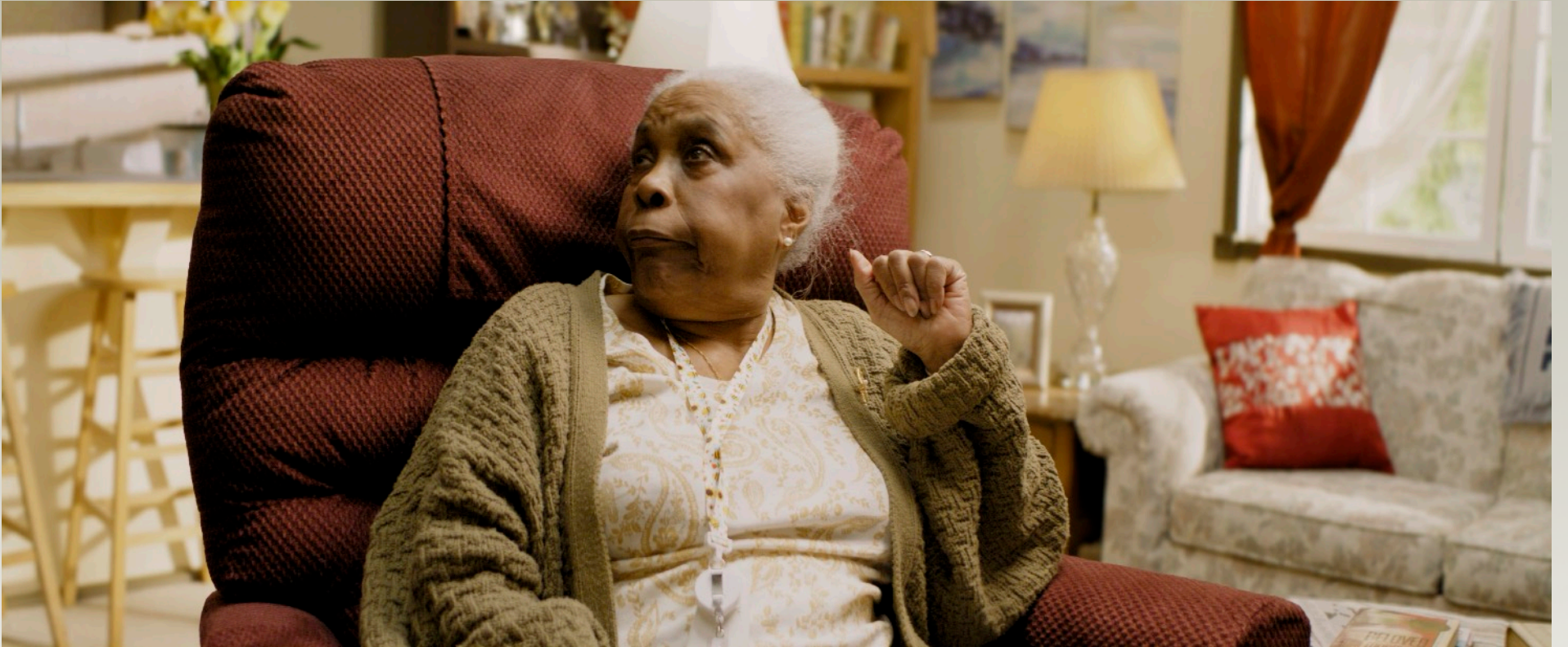
Minutes to Go Tri-C Films