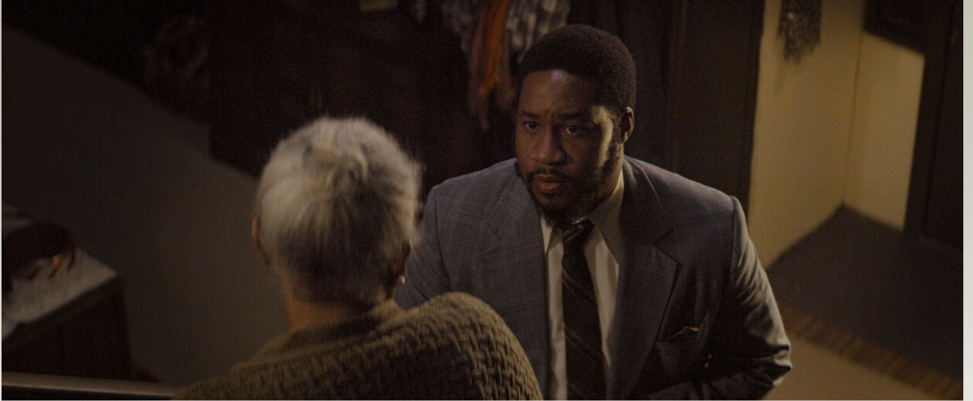
Minutes to Go Tri-C Films