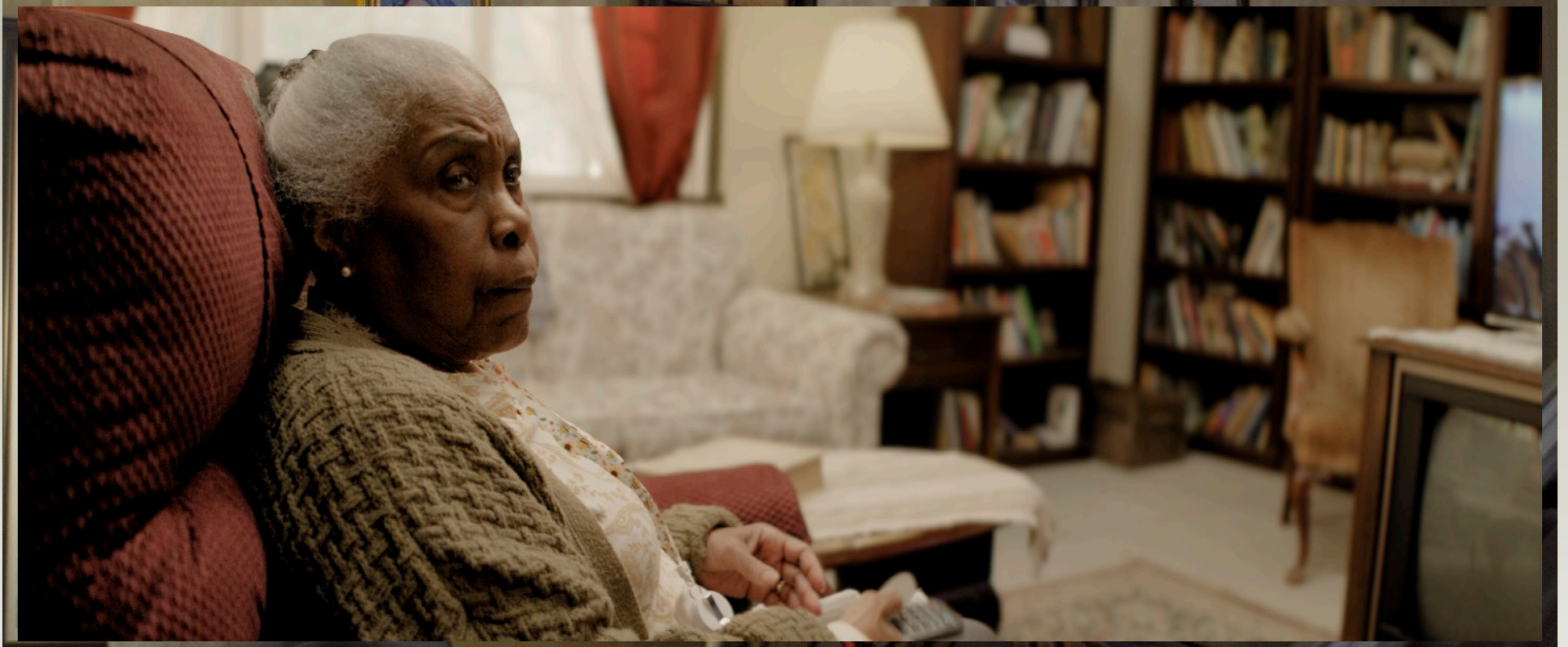
Minutes to Go Tri-C Films