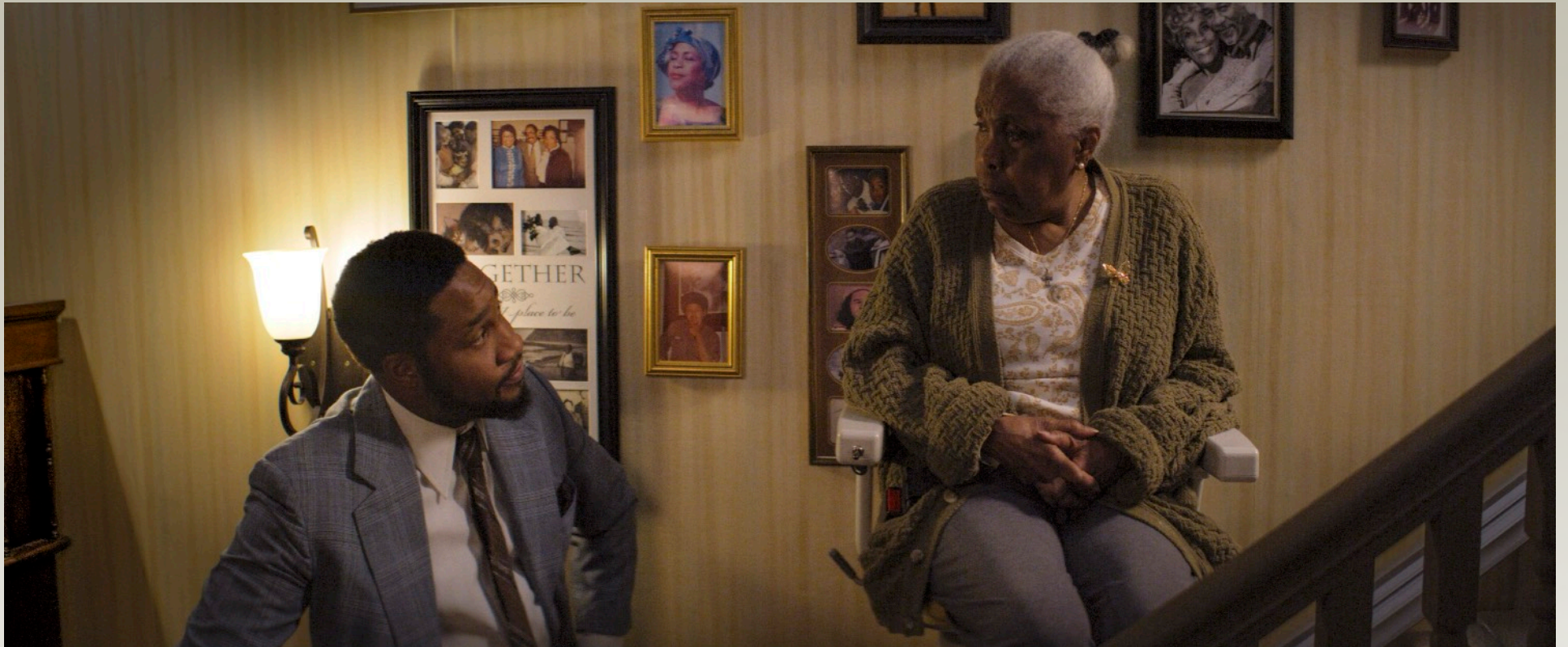
Minutes to Go Tri-C Films