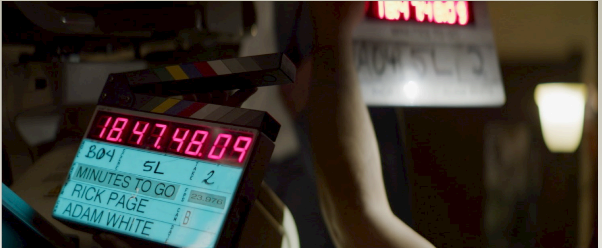
Minutes to Go Tri-C Films