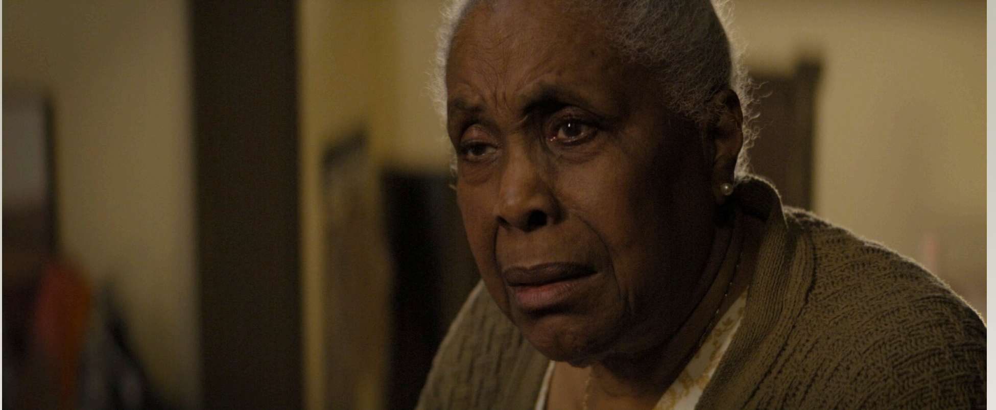
Minutes to Go Tri-C Films