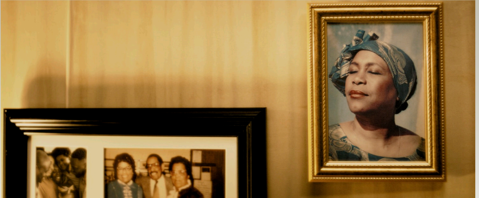
Minutes to Go Tri-C Films