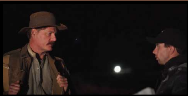
The vision of the Director