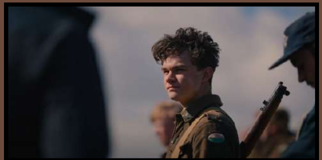
Origin of the story