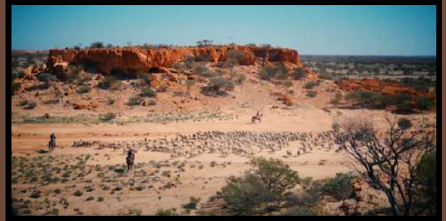
Ensuring the authenticity