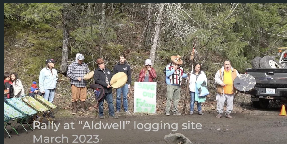
Rally at "Aldwell" logging site March 2023