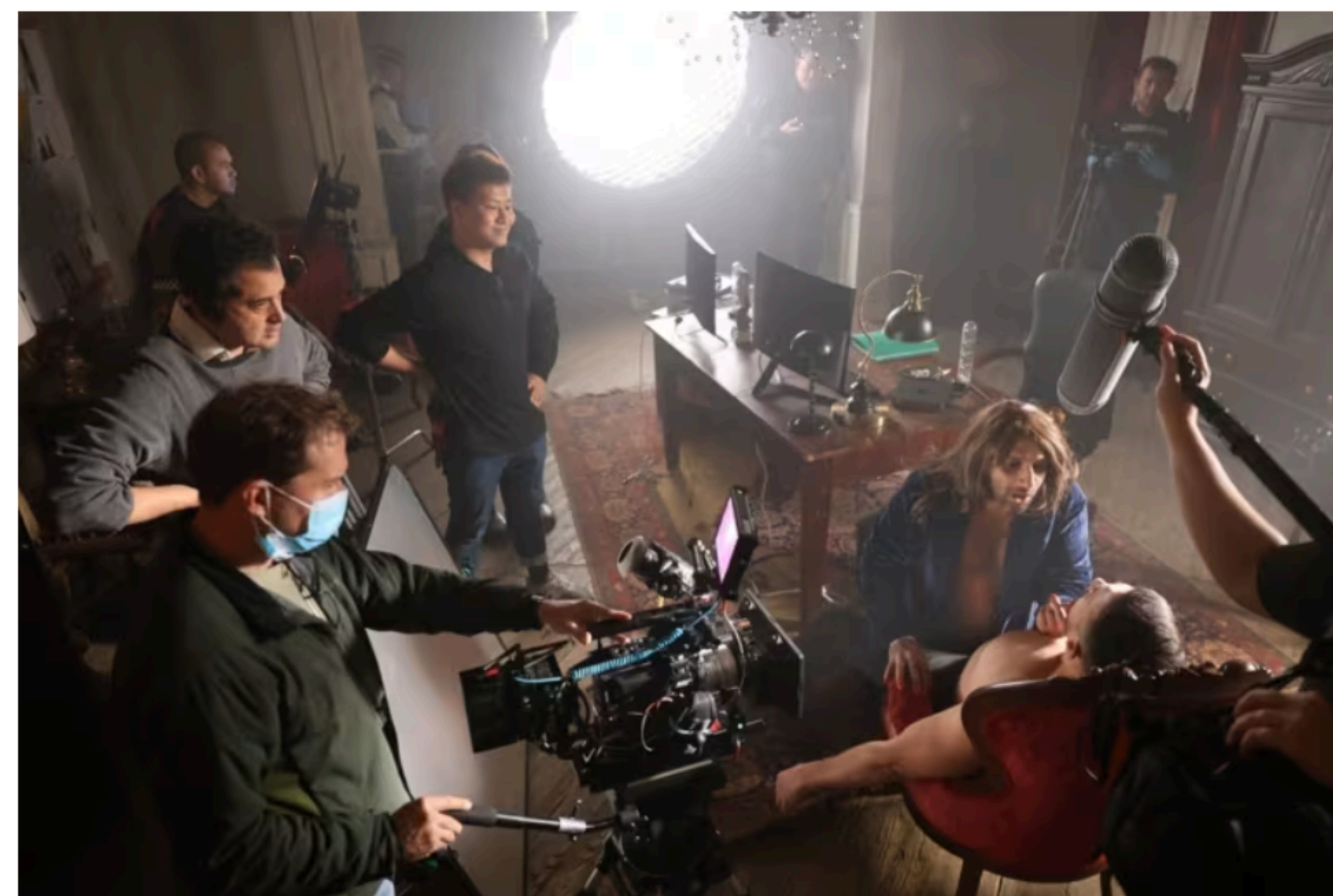
On the set of "Kiss of the Con Queen" at Warren Studios in the U.S. city of Nashville. Other locations included Thailand, Indonesia and Ireland.