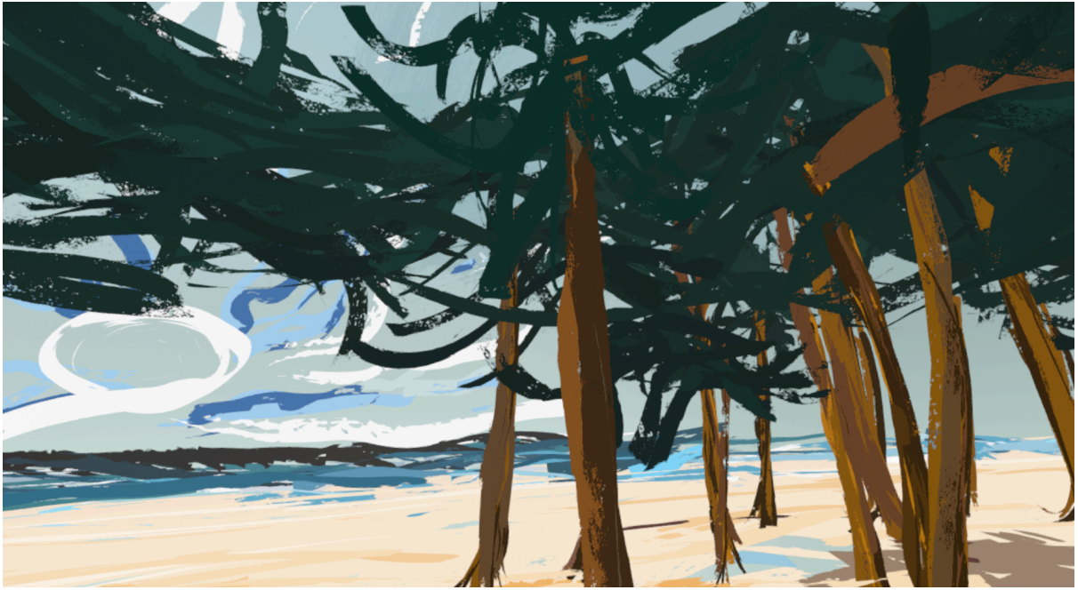
Installation cube photo at the Demo at Ithra: