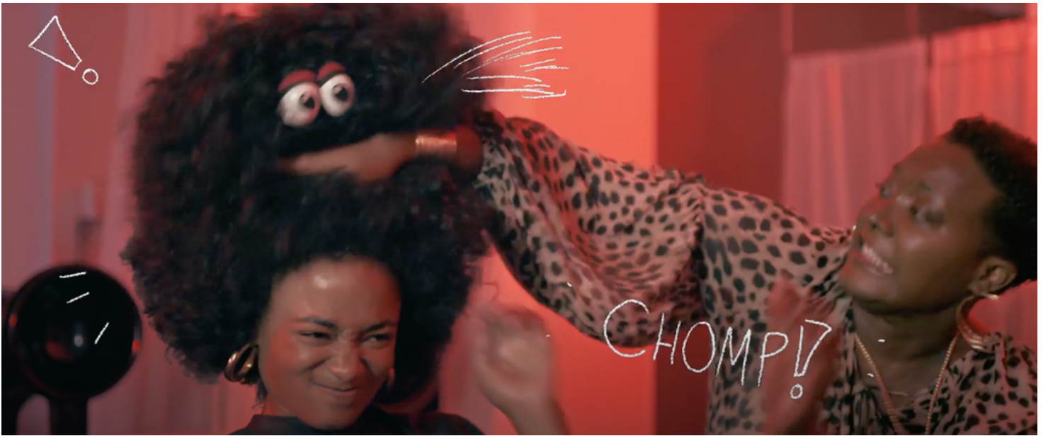
(A STILL FROM FILM)