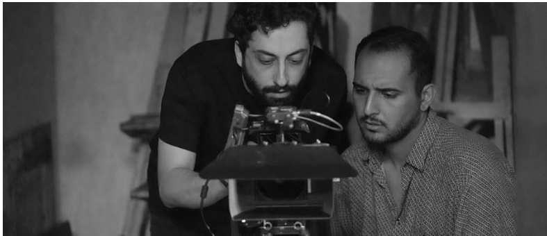
BEHIND THE SCENE