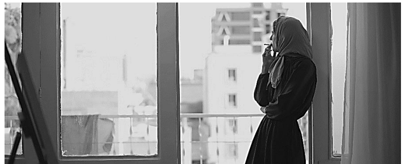
POSTER, PRESS-KIT, MEDIA ...