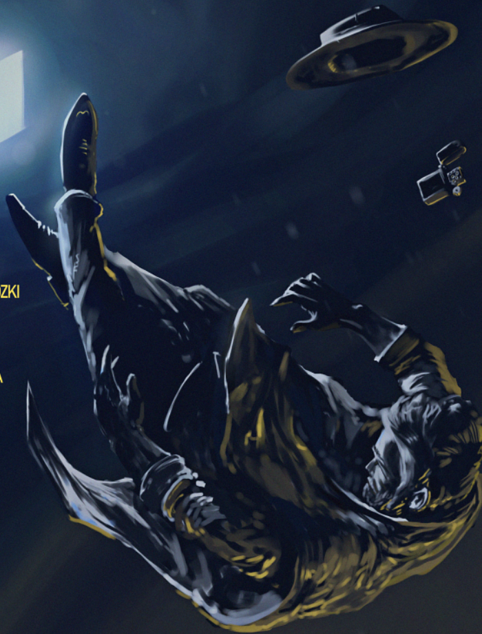
ILLUSTRATION BY LOIS MORDASINI ABER