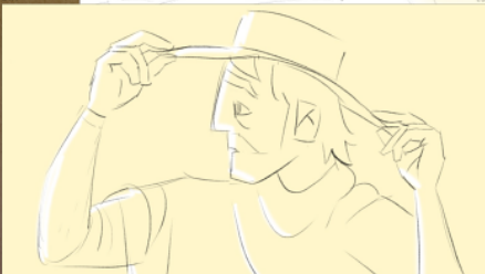
The man is astounded...