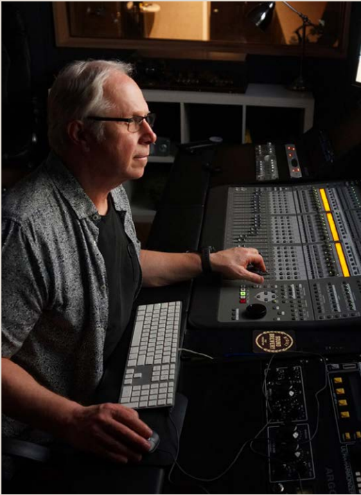
SOUND DESIGNER/ MIXER