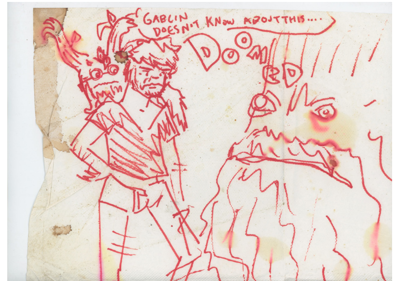
Diner placemat drawings made during production, Meg Powers, 2011

Allen Riley | 58 min | 2021 Spectacle Theater, Brooklyn NY August 6, 9, 13, 22, 2022