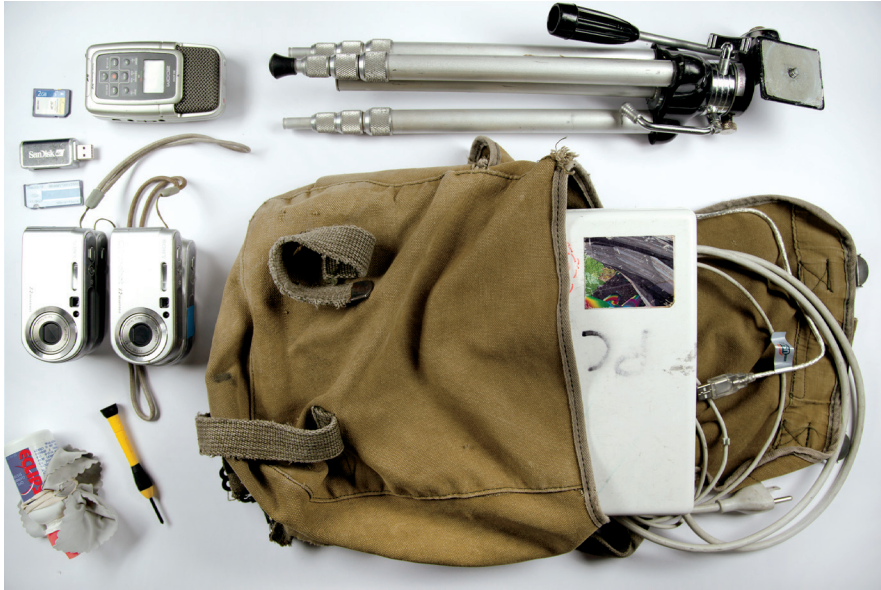
DOOMED production kit, 2011