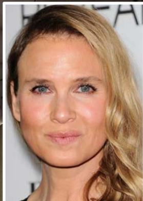
Renee Zelwiger Bridget Jones' Diary Cinderella Man Cold Mountain