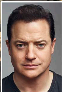
Brendan Fraser No Sudden Move The Mummy Crash