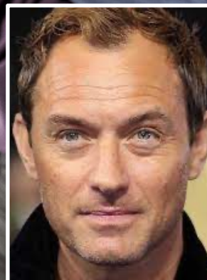
Jude Law Fantastic Beasts: The Crimes of Grindelwald Sherlock Holmes Captain Marvel