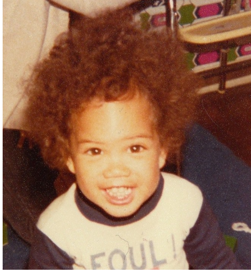
Me as a kid!

I acted, shot, wrote, directed, and edited Eleanor Slaughter . If Prince could play all 27 instruments for his 1978 album For You , I thought I would make a similar attempt!