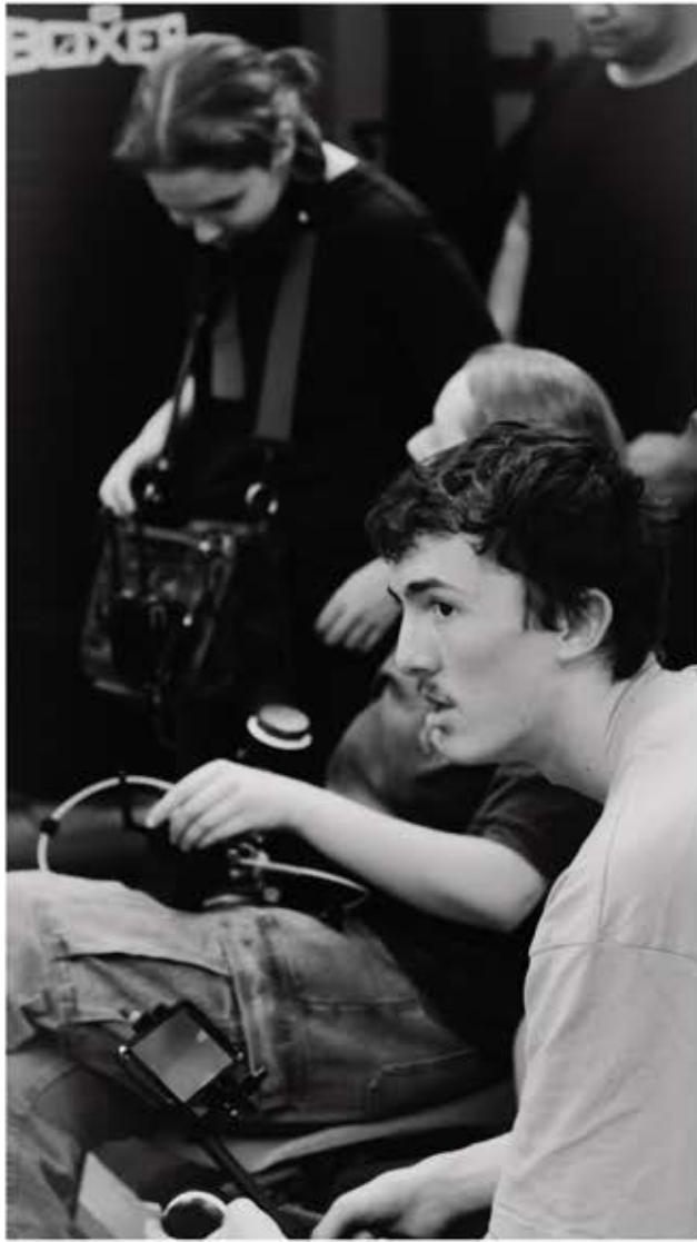
1ST AC.B CAM