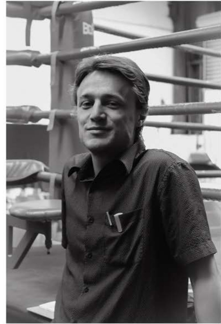
1ST ASSISTANT DIRECTOR