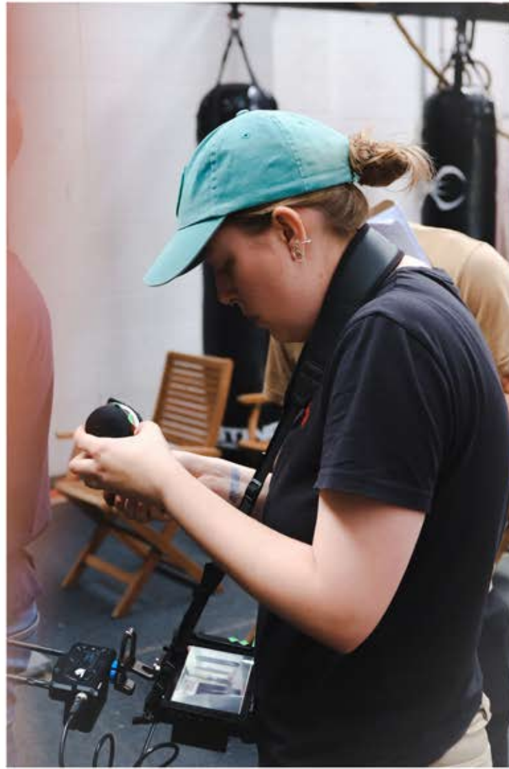
1ST ASSISTANT CAMERA