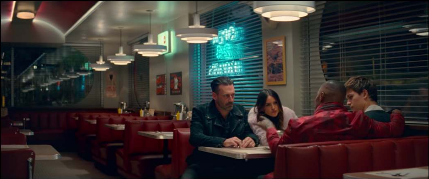
Baby Driver (2017)