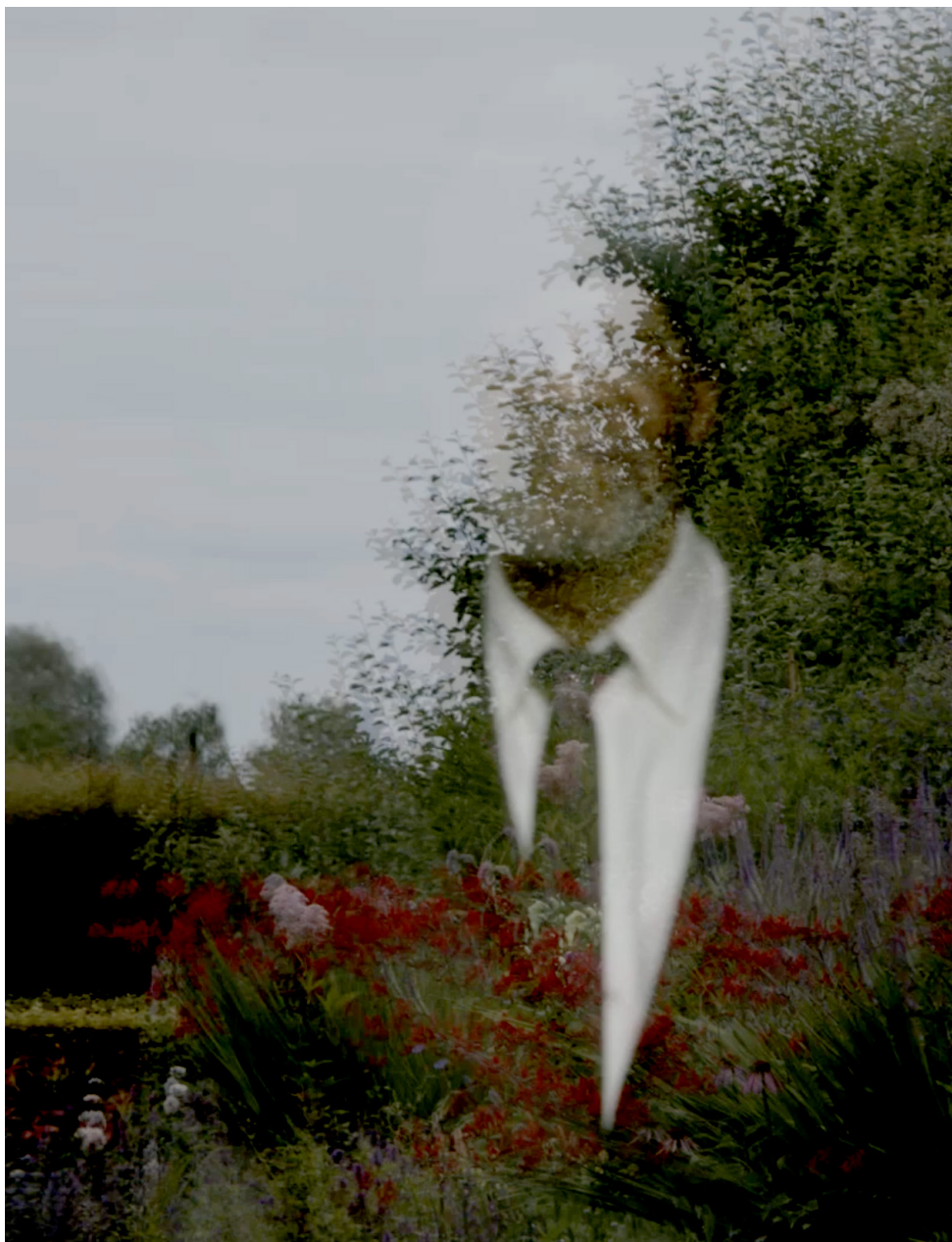
Still from scene: Looking at the Hundson river