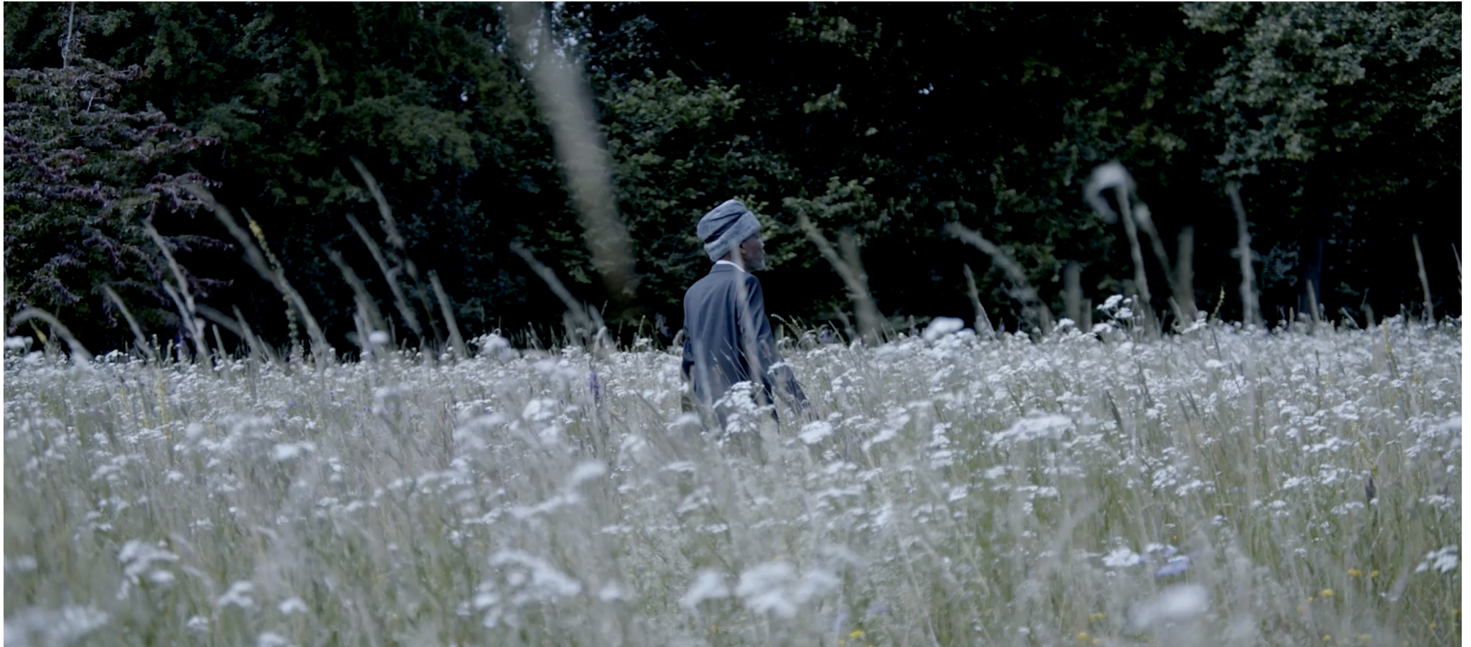
Still from scene: Monk dancing on stage

“Where were did you go? ... sleepless for days on end, standing at the Weehawken window. I imagine you directing the clouds, speaking with the birds and bees, or swimming across the Hudson River with slow butterfly strokes. Riding the waves, turning them into meandering, convoluted melodies. In those ensuing waking hours, I would picture you like Sisyphus, against all odds, pushing on, rolling a rock to the top of a hill, and then watching it roll down, whistling your Pannonica tune, as you languidly descend back to the foot of the hill”.