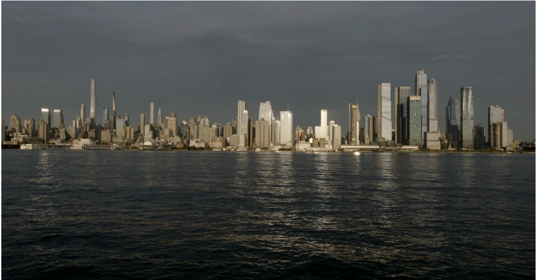
Still from scene: Monks last wish

Press kit DIG IT a film by Gabriel Lester