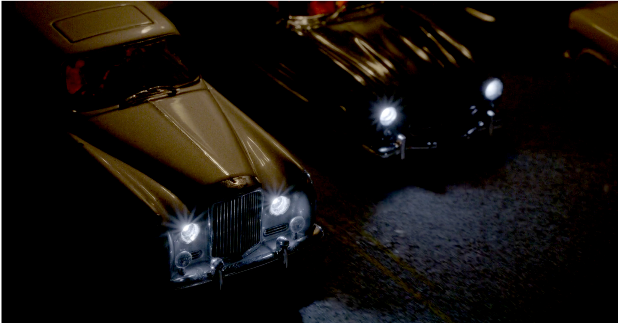
Still from scene: Chasing Miles

Press kit DIG IT a film by Gabriel Lester