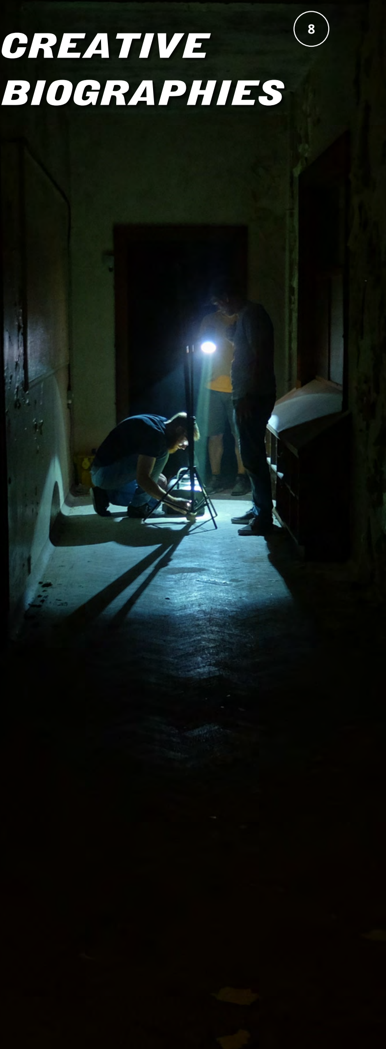
PHOTO: CREW, ALLER PARK, DARTINGTON