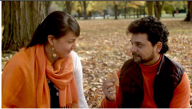
When husband and wife fall in love again and again...