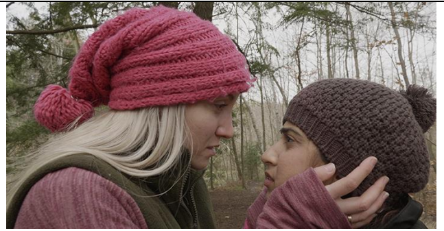
When two girls discover they are in love.