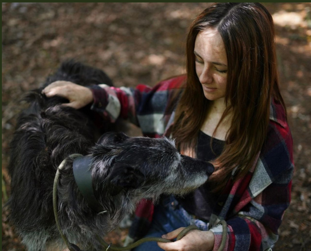
Pudding as the Dog