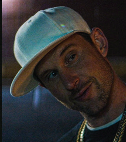
Wil Crown 'DON'

He is known for: 'Dynasty' 'Bigger' 'Seal Team'