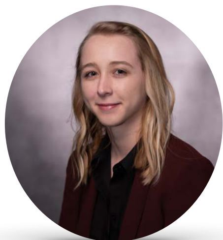
DIRECTOR OF PHOTOGRAPHY