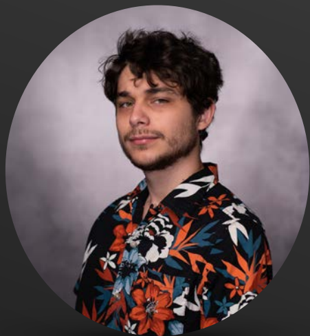
director of photography