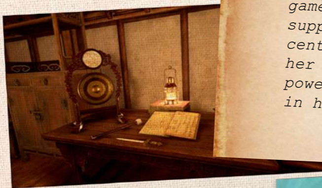
'THE PIRATE QUEEN'