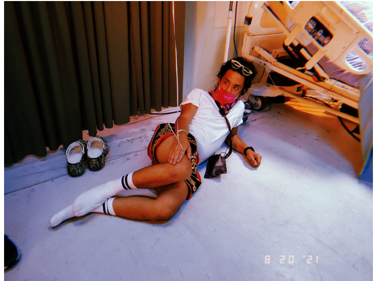
ALEX LEPKOWSKI - PRODUCTION DESIGNER IGGY SOLIVEN - PRODUCTION DESIGNER