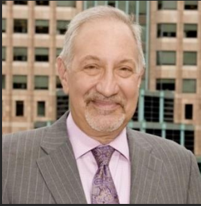
Mark Geragos Executive Producer

Mark Geragos is famous around the world for prevailing in “un-winnable” cases. He represents countless clients whose household names and “A-list” celebrity status carry as much potential to convict as to exonerate. Geragos’s decades of experience standing up for the underdog make his role executive producing ‘Motherland’ familiar territory. Geragos was one of the lead lawyers in two groundbreaking federal class action lawsuits against New York Life Insurance Co. and AXA, for insurance policies issued in the early 20th century during the time of the Armenian Genocide, which saw the inhuman slaughter of more than 1.5 million Armenians. The two cases his firm argued settled for over $37.5 million, in 2004 and 2005.