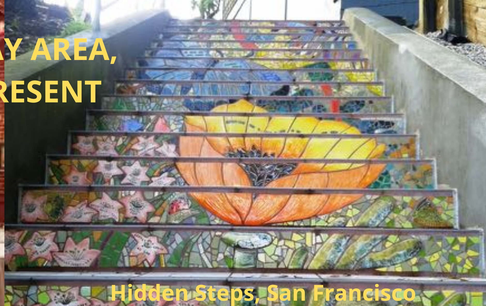
Hidden Steps, San Francisco