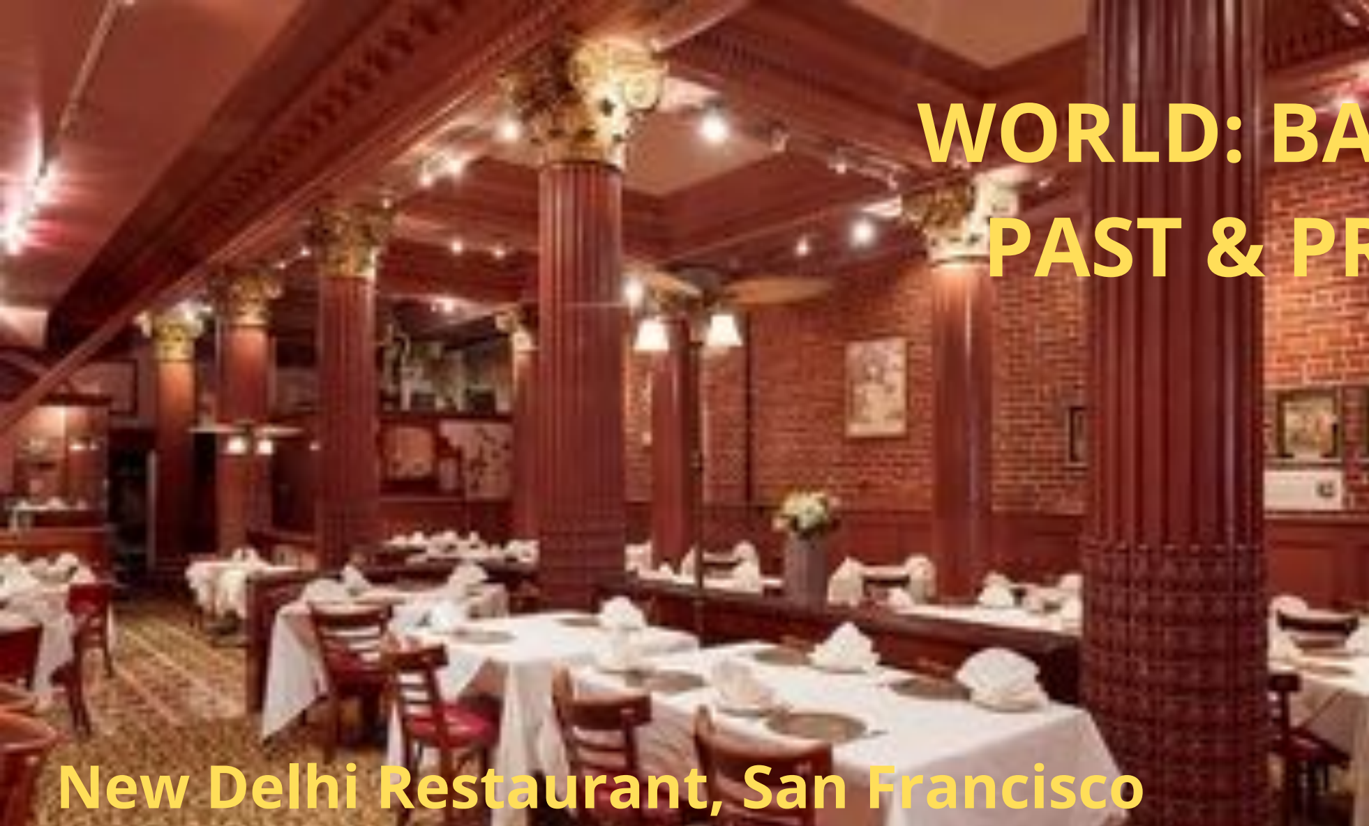
New Delhi Restaurant, San Francisco