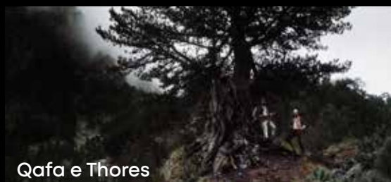
Qafa e Thores