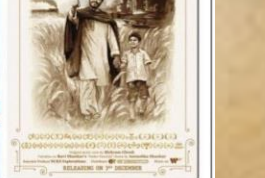
The film's poster