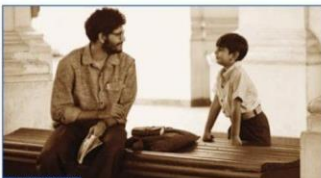
A still from the film