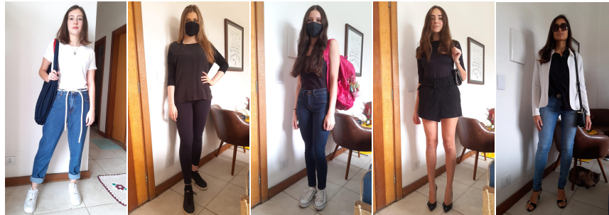
Prova de roupas / wardrobe tests